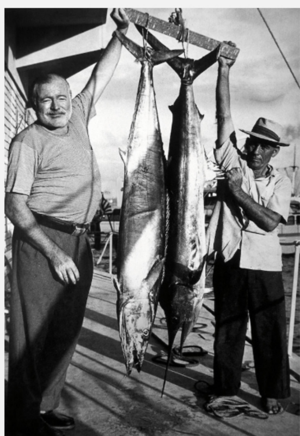
Hemingway fishing at Cabo Blanco

Today, seven decades later, Cabo Blanco stands at the threshold of a profound renaissance. Coinciding with Inkaterra's 50th anniversary, the company has inaugurated its eighth property—Inkaterra Cabo