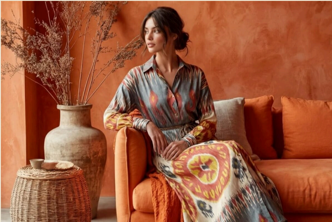
Silk Ikat fashion.

On Scotland's remote Morvern peninsula, Nc'nean is an independent distillery making organic single malt whisky from Scottish barley and powered entirely by renewable energy. The team avoids the use of peat to protect peatlands as carbon sinks and bottles in 100% recycled glass and has cut its own operational emissions to net zero, using verified offsets only for what it can't yet eliminate.