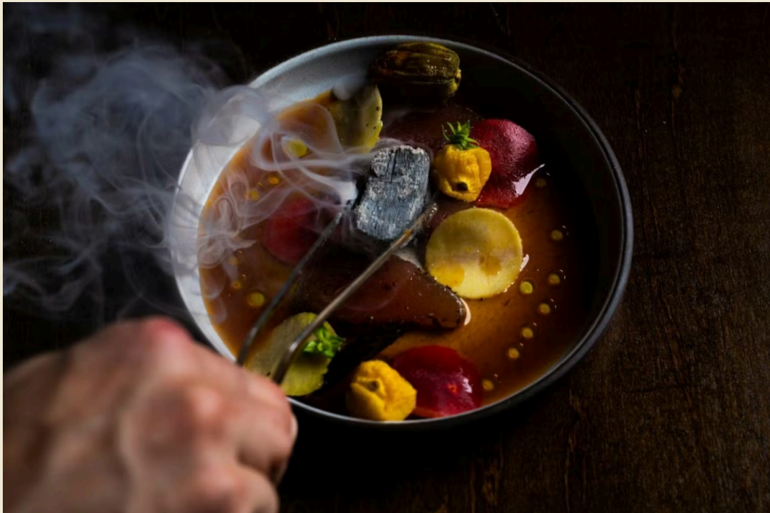
Striking plated artistry.

Populus Hotel stands out in downtown Denver as a bright, aspen-inspired tower with deep oval windows that shape both its exterior and its rooms. The hotel positions itself as carbon positive over the life of the building , publicly tracking and publishing the environmental cost of its construction and ongoing operations. Interiors are warm and contemporary, with window benches that double as work and lounge space and strong food and drink programs from Pasque and the Stellar Jay. The experience feels well-designed and upmarket, with layouts and amenities that work equally well for leisure and business travel. Populus recently opened a second location in Seattle, WA.