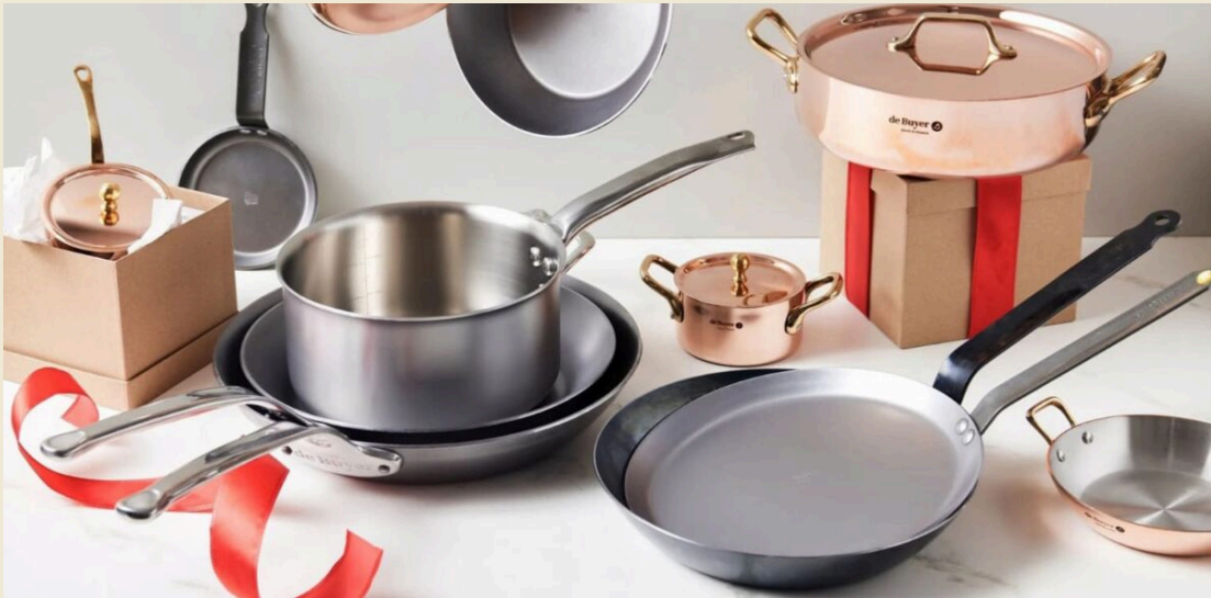
de Buyer cookware.