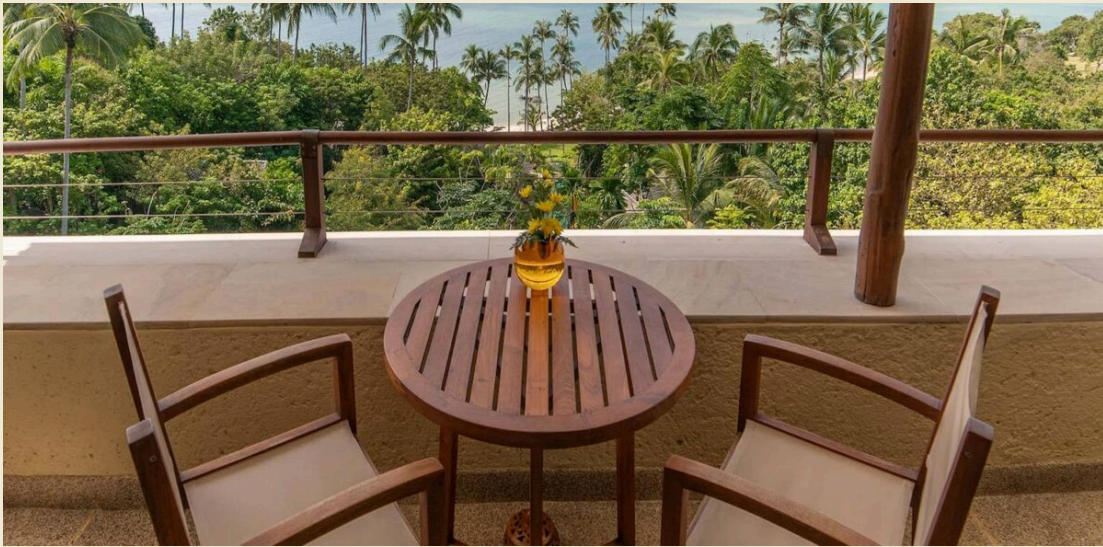
Luxury Sea View Suite, Koh Samui.