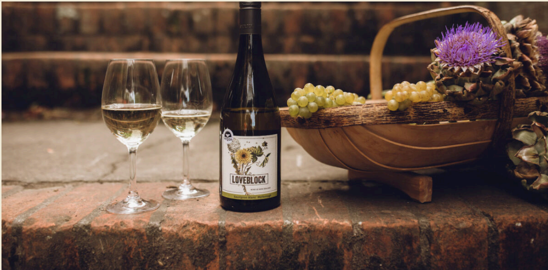
Sauvignon Blanc Glasses & Basket shot.