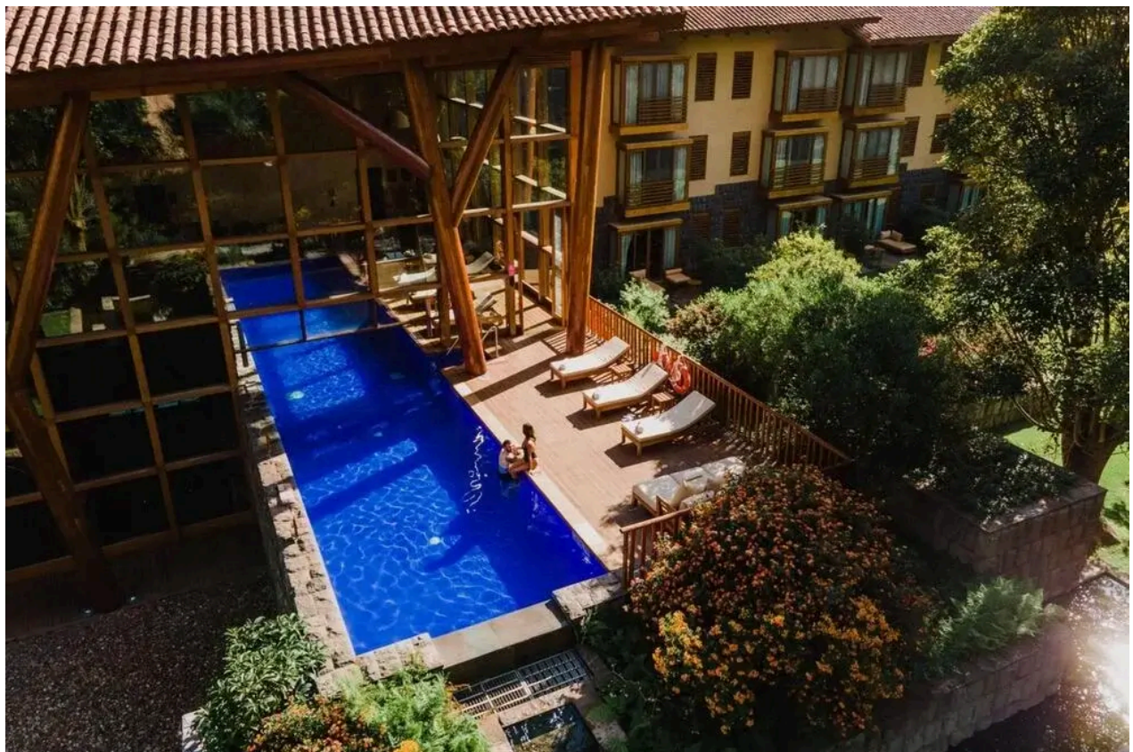
Tambo del Inca