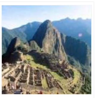
Machu Picchu, Cuzco and Peru's