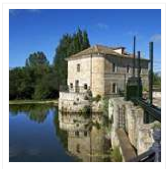
Hacienda Zorita Wine Hotel and Spa.