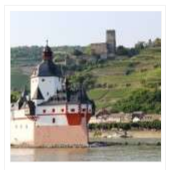
The Rhine Valley. Or should it be the Vine