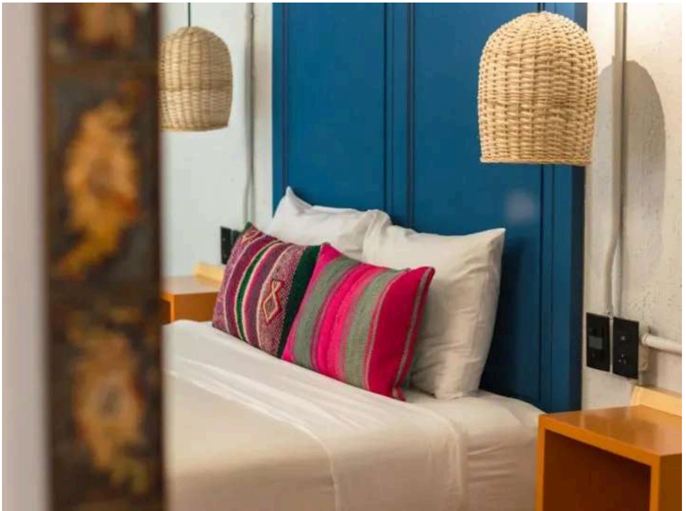
Bedrooms are modern and bright in the beautifully designed Selina Miraflores .

The standard double rooms are huge, with a queen-sized bed and seating area. Each room in the hostel has a mural painted by a Limeño artist, making it a superb choice of Peru hotel if you want to learn more about the country's street art culture.