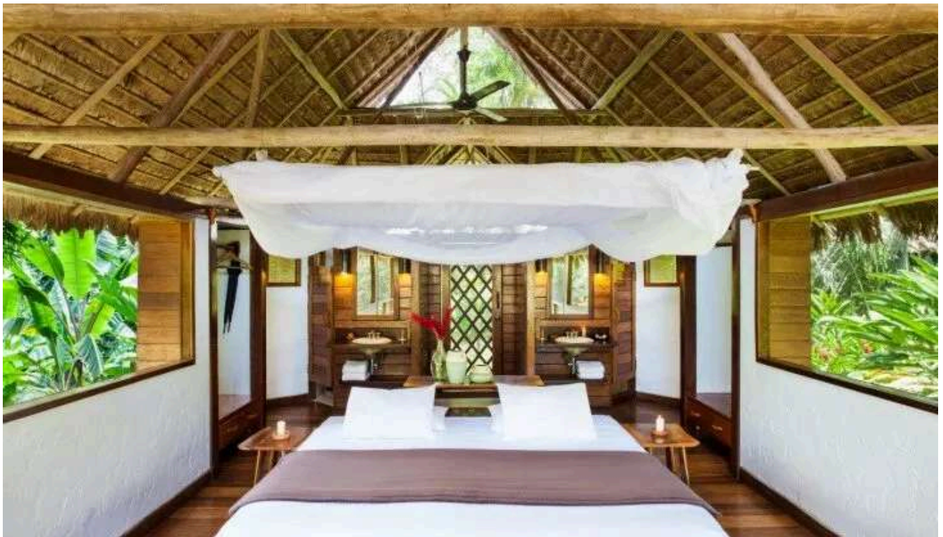
This luxury wooden cabin is open to the rainforest so you have a unique close experience with nature.

Offering rustic luxury (think spotless wooden cabins opening out onto the rainforest and slung with silky mosquito nets to protect you from any unwelcome visitors) and a location just 45-minutes downstream, this lodge is the perfect introduction to the delights of the Amazon.