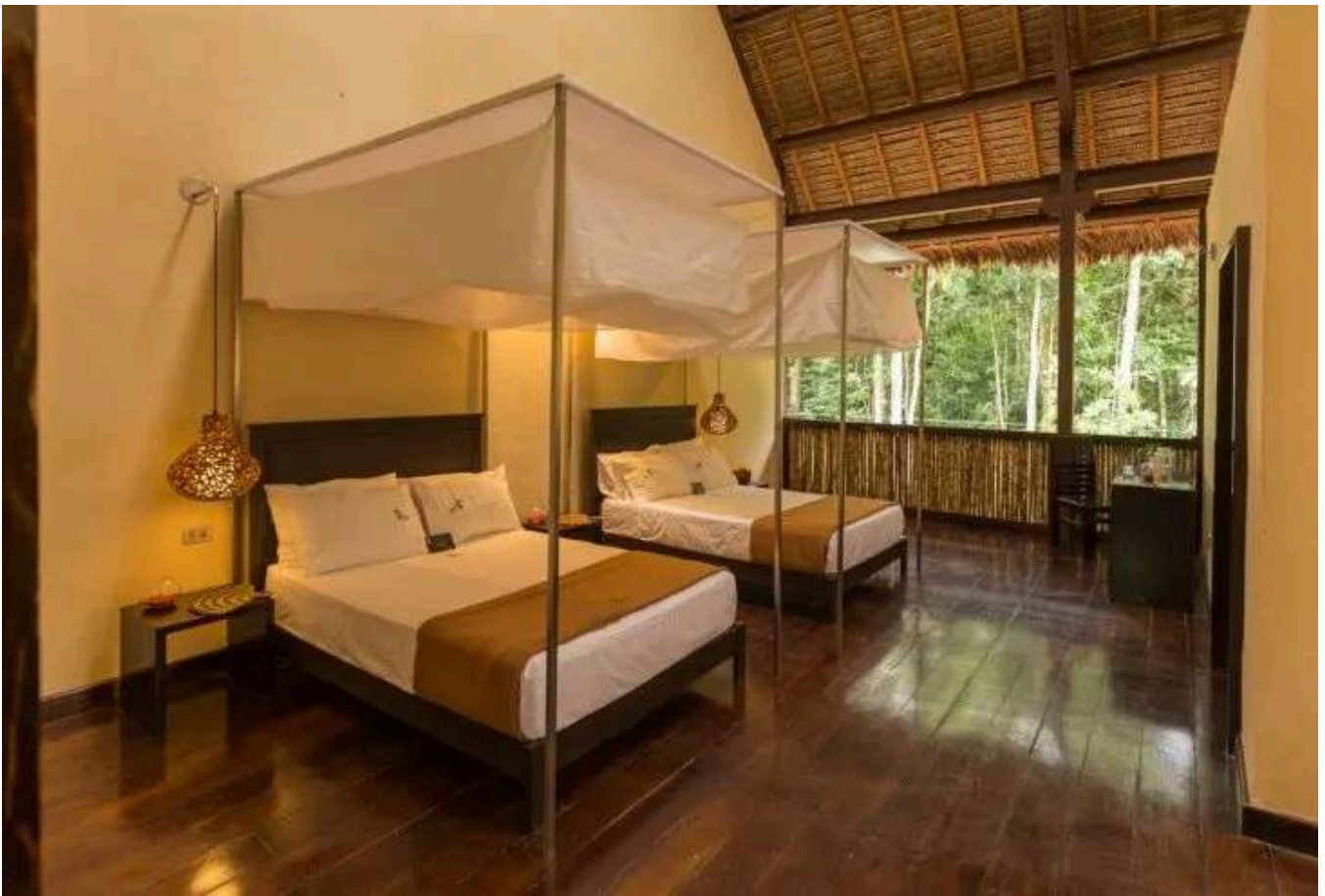
The rooms are designed to connect you with nature during every moment of your stay.

But when you do, you'll quickly learn why this lodge is considered one of the best in the region. Not only has the lodge been a pioneer in environmental protection in the Peruvian Amazon, but they've also worked with local indigenous people to help protect their ancestral lands.