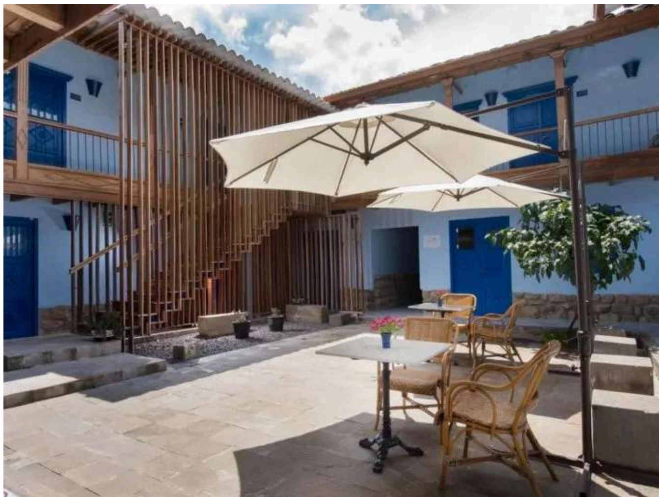
The affordable boutique hotel, Quinta San Blas , is located in the beautiful San Blas neighborhood.

Bedrooms have crisp white linens and blue statement decorations and look out onto a sunny courtyard area. Light blue walls and natural wood balconies surround the interior patio of this boutique hotel.