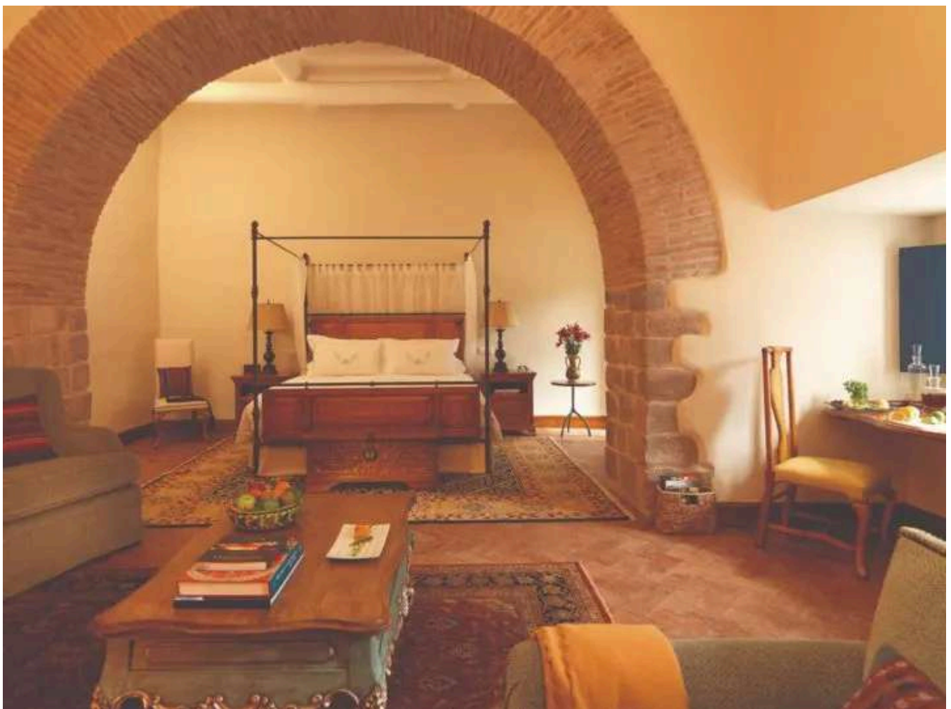
Bedrooms at the Belmond Palacio Nazarenas are fit for the Inca himself!

Part of the Belmond chain (who run the luxury train to Machu Picchu as well as the Andean Explorer from Cusco to Arequipa), this is indeed the top of the top when it comes to the best hotels to stay in Cusco.