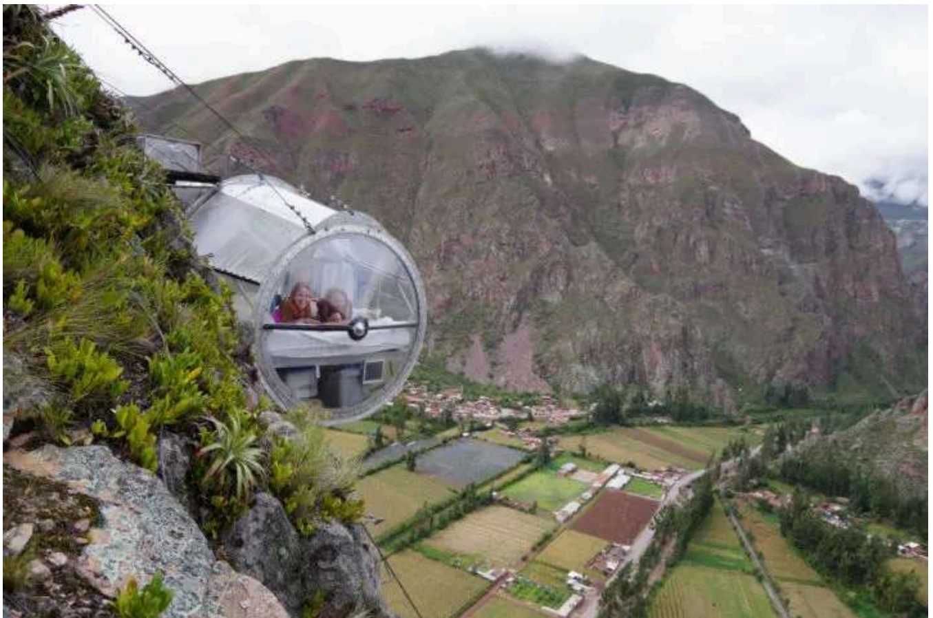
The rooms at Skylodge Adventure Suites are not for those with vertigo!

It should come as no surprise that Skylodge is one of our top picks of the best hotels in the Sacred Valley .