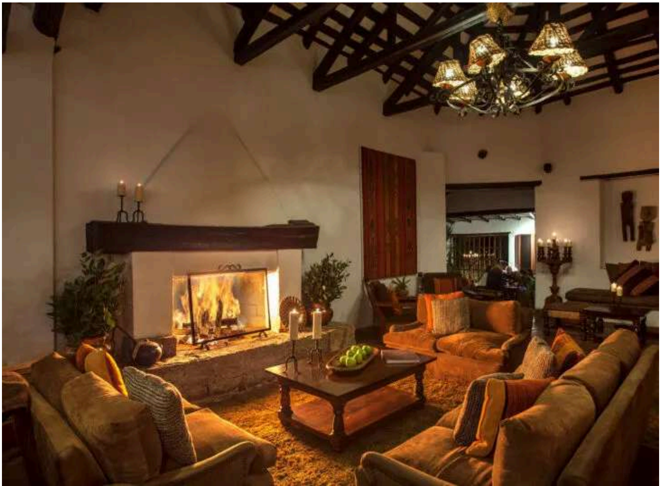
The Inkaterra Machu Picchu Pueblo Hotel offers a uniquely comfortable experience inside the cloud forest.

Stay at one of their 83 whitewashed houses, which fit the ambiance of Aguas Calientes with their rustic but tasteful décor. Upgrade to Superior Deluxe room (S/2,334 or $602 USD double) to have an indoor fireplace - the perfect cozy spot for curling up with a good book or company.