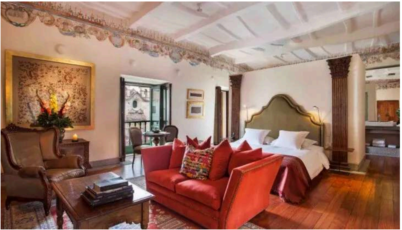
All of the suites at Inkaterra La Casona capture the rich history and culture of the city.

There's also a spa and restaurant here to ensure absolute comfort during your stay, while a relaxing courtyard provides the opportunity to while away the hours with a book or drink in hand and enjoy the complimentary tea time or happy hour.