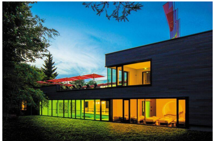
Modern Spa-Area at the Naturresort Schindelbruch