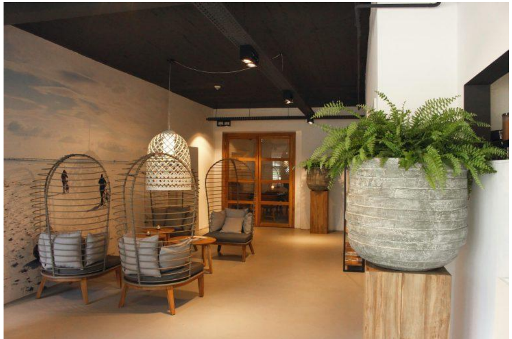
The hotel at the Baltic Sea in its spacial SAND-Look.

( https://www.greenpearls.com/hotels/sand-lifestylehotel/ ), the name speaks for itself, because the exterior design, as well as the interior decoration, reflects the atmosphere of the beach and the sea. Many pieces of furniture are made of recycled teak wood. The building was already a hotel in former times.