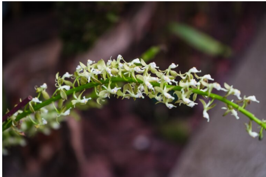
Among the 30 orchid species is the Epidendrum cylindrostachys , an epiphytic orchid with miniature yellow and purple-spotted flowers.

Named Orchids of Machu Picchu , the floral display is a collaboration between Gardens by the Bay and the Embassy of Peru.