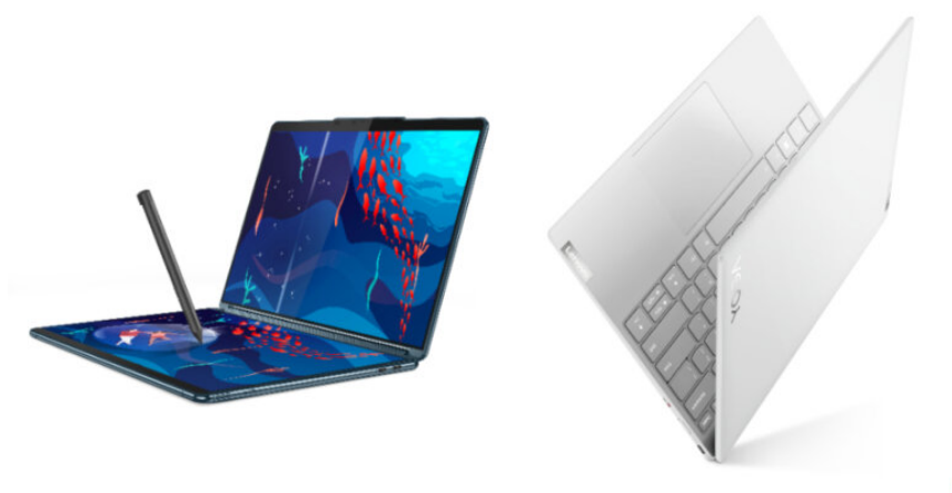
The laptops can also be purchased during the showcase, with promotions available for those that purchase models worth $1,500 and above.

Visitors can drop by the store and Lenovo’s Creators Zone to test out the new devices, which include the Yoga Pro, Yoga Slim and Yoga Convertible.