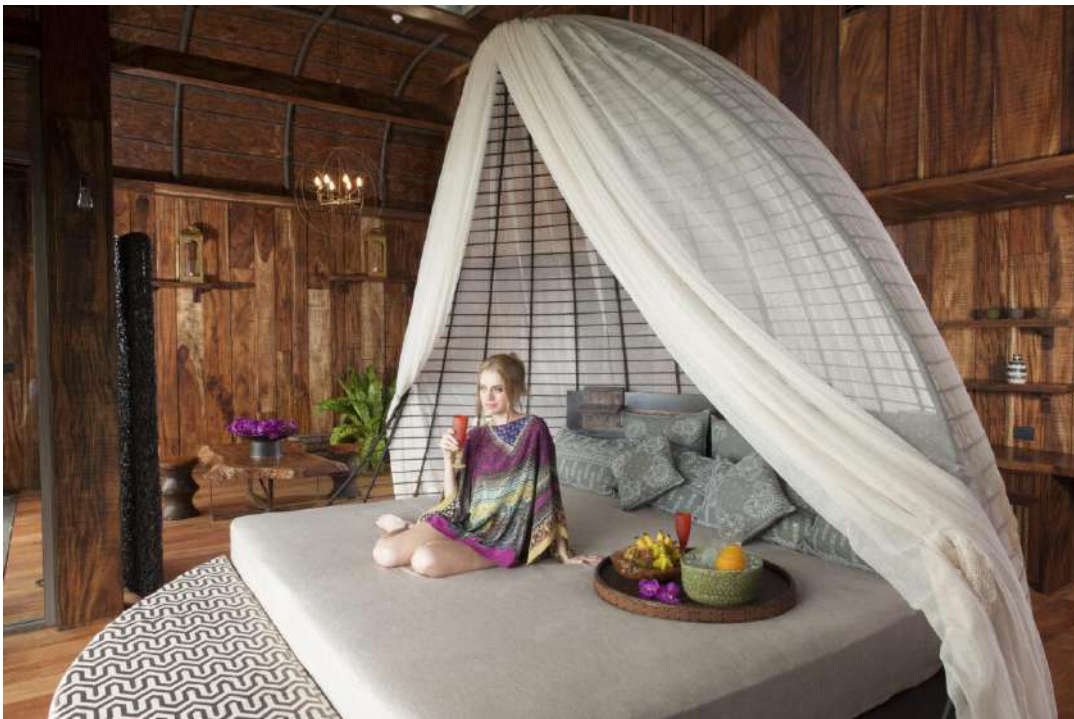
At Keemala, you will find various surprises on your bed, such as a fresh fruit basket.