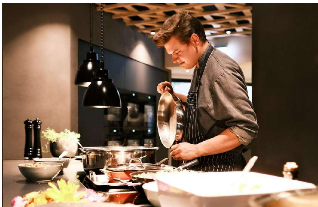
Look over the chef’s shoulder in the open kitchen.

At STURM ( https://www.greenpearls.com/hotels/hotel-sturm/ ), in Mellrichstadt in the Rhön region of Germany, the kitchen concept has been changed to an open kitchen. The chefs are trained to “configure” the food to your exact liking while cooking, and are also available to answer questions. Ingredients include fruits, herbs and vegetables from the hotel’s own garden ( https://green-travel-blog.com/plant-something-yourself/ ).