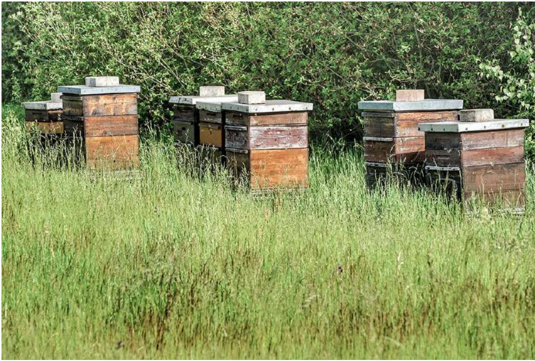
Bees live on the hotel grounds.

At the Naturresort Schindelbruch ( https://www.greenpearls.com/hotels/naturresort-schindelbruch/ ), in the southern Harz region, you can buy honey from the Kolbe migratory apiary in the hotel shop. The beehives are located in the meadows surrounding the hotel.