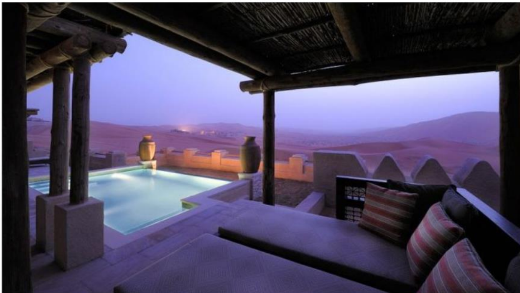
Jakku, The Desert Planet | Abu Dhabi, UAE

Amongst the canyons and plateaus near the Grand Staircase – Escalante National Monument, Amangiri is an otherworldly oasis. If Jabba the Hutt were still alive, he'd live it up at the 34-suite property—cooling off in the pool and relaxing by the fire right outside his suite. Hard to picture him hiking, rock climbing, canyoneering, or biking though, but guests do have the option.