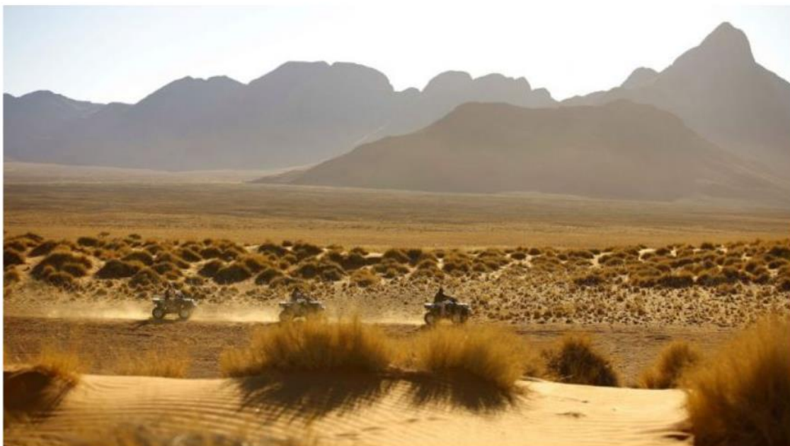
Jakku, The Desert Planet | Namib Desert, Namibia

Chile's Atacama Desert could easily stand-in for Jakku too; it is, after all, home to Valle de la Luna ("Valley of the Moon" for those rusty on Spanish). Sitting in one of Tierra Atacama Hotel & Spa's curved poolside chairs could feel a little like sitting in the Imperial throne. The simple, natural interiors of the rooms don't feel far off from what set decorators might choose for a young Jedi.