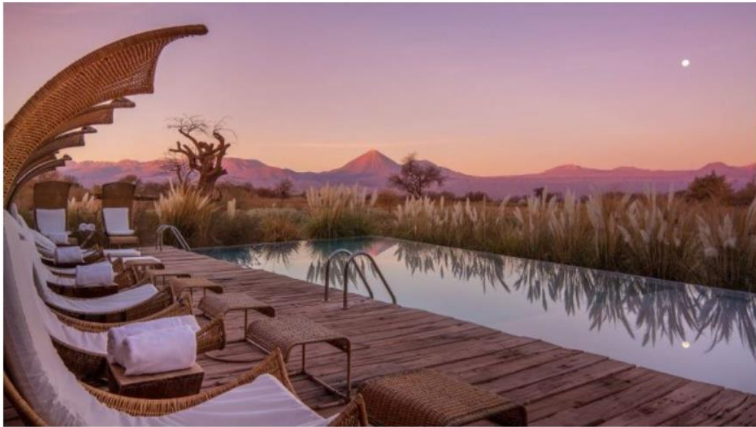
Jakku, The Desert Planet | Atacama Desert, Chile

Chile's Atacama Desert could easily stand-in for Jakku too; it is, after all, home to Valle de la Luna ("Valley of the Moon" for those rusty on Spanish). Sitting in one of Tierra Atacama Hotel & Spa's curved poolside chairs could feel a little like sitting in the Imperial throne. The simple, natural interiors of the rooms don't feel far off from what set decorators might choose for a young Jedi.