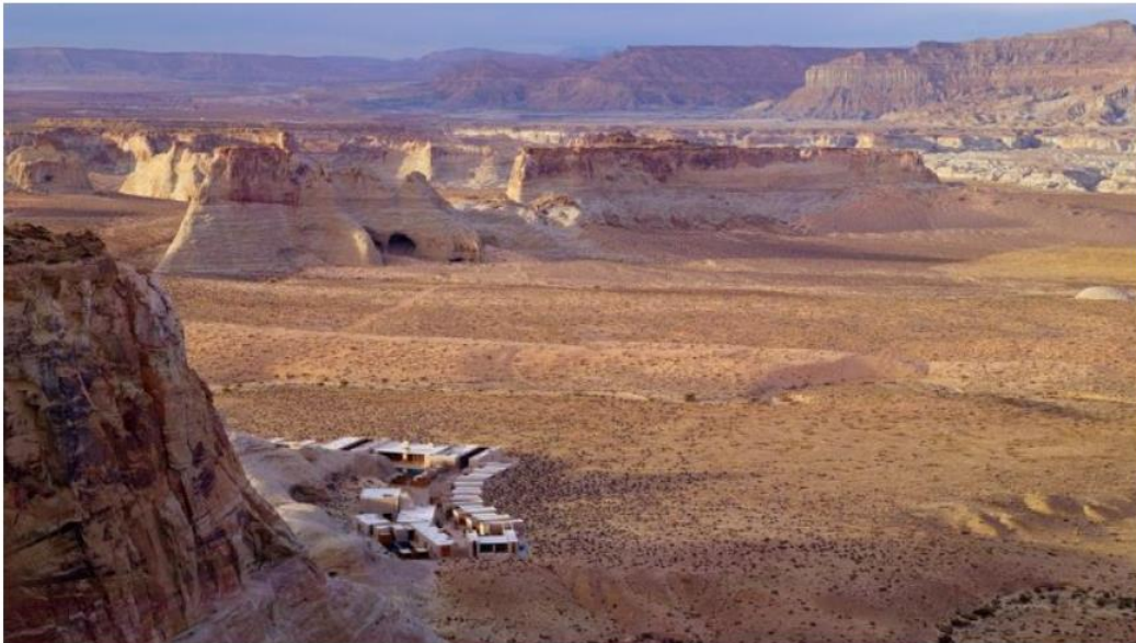
Jakku, The Desert Planet | Canyon Point, Utah

Amongst the canyons and plateaus near the Grand Staircase – Escalante National Monument, Amangiri is an otherworldly oasis. If Jabba the Hutt were still alive, he'd live it up at the 34-suite property—cooling off in the pool and relaxing by the fire right outside his suite. Hard to picture him hiking, rock climbing, canyoneering, or biking though, but guests do have the option.