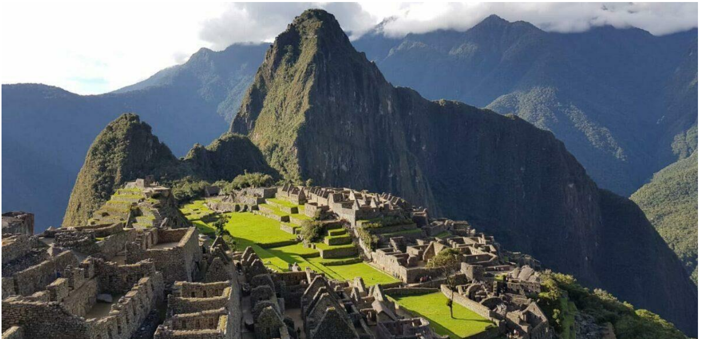
Blick auf ein Weltwunder: Machu Picchu

If you are interested in the history of early civilizations, the Inca archaeological site of Machu Picchu in the Peruvian Andes is one of the most famous sites in the world. Nearby is the Inkaterra Machu Picchu Pueblo Hotel , one of the pioneers of ecotourism. The hotel actively contributes to the preservation of ancient cultural treasures and offers exclusive guided tours and hikes.