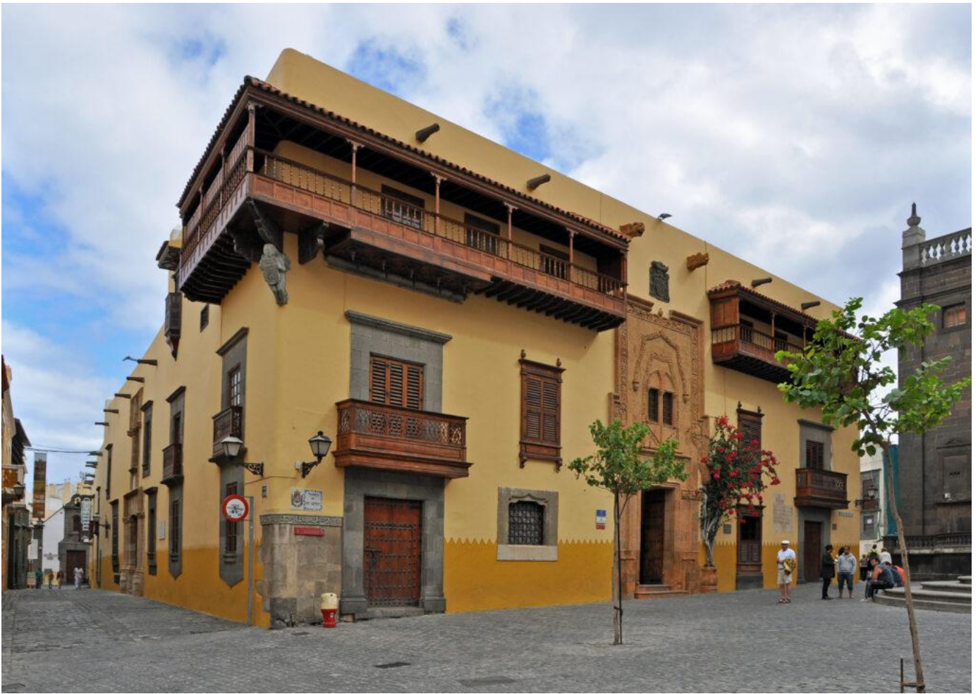
Columbus House in Las Palmas on Gran Canaria