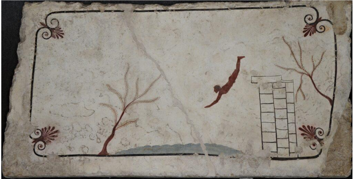
Fresko aus dem "Grb des Tauchers" in Paestum

Paestum National Archaeological Museum ( http://www.culturaitalia.it/opencms/viewItem.jsp?id=oai:culturaitalia.it:museiditalia-mus_268 ), you'll see the famous "Tomb of the Diver". The various frescoes on the walls of the tomb will make you wonder: who was this man, and how did he live here in 450 BC?