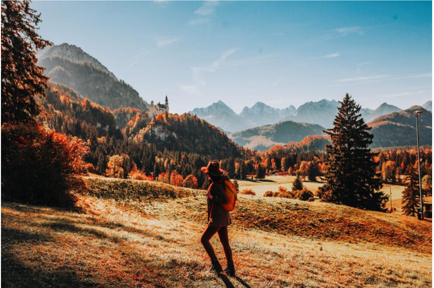
The fairy tale castle within reach | ©Hotel Das Rübezahl

If you have a fable for fairy tale castles and are interested in stories of kings, princesses, and knights, you should definitely head to Allgäu. Here you will find the Museum of the Bavarian Kings in Hohenschwangau ( https://www.hohenschwangau.de/en/museum-of-the-bavarian-kings ) near Füssen. It gives you a vivid insight into the history of the Bavarian royal family and is the perfect preparation for a tour of the castles, the most famous of which is the fairytale castle of King Ludwig II: Neuschwanstein ( https://www.neuschwanstein.de ). You can see it directly from our Green Pearls® partner Das Rübezahl ( https://www.greenpearls.com/hotels/hotel-ruebezahl/ ). The atmosphere in this sustainable hotel is also very charming and romantic. Tickets for the castle are available at the reception.