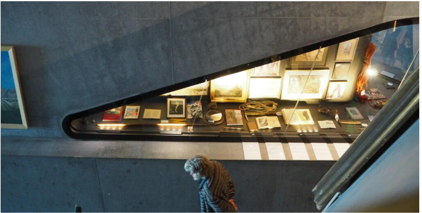
Reinhold Messner at the Messner Mountain Museum Corones