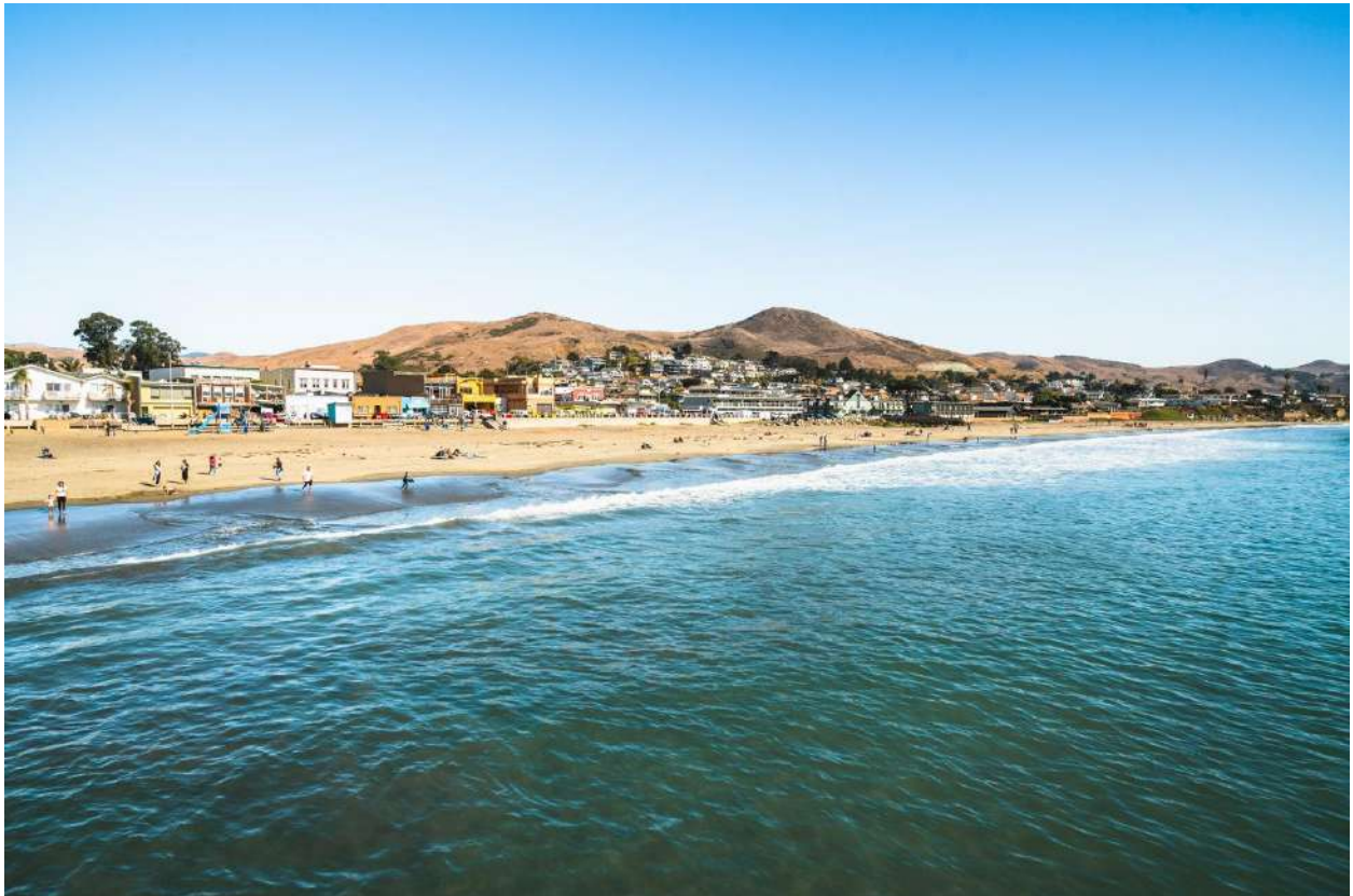
Cayucos, one of the beach towns on California Central Coast

All listings featured in this story are independently selected by our editors. However, when you book something through our retail links, we may earn an affiliate commission. This article has been updated with new information since its original publish date.