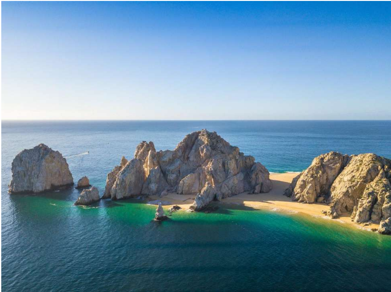
Lovers Beach on the Sea of Cortez in Los Cabos, Mexico

Where to stay: The Chatham Bars Inn , which partners with the AWSC on the great white receiver tours. For a classic family vacation, stay in shingle-style cottage or residence at waterfront Wequassett Resort and Golf Club , a family-friendly resort with a robust children's center, pirate-themed splash park, and a pool deck you'll never want to leave.