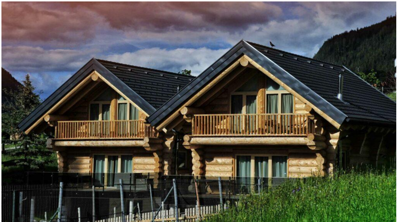
Sustainable Stay in the Alps

The Alpine region offers a wonderfully fresh climate and many opportunities to experience nature. How about a white-water rafting trip on the Bad Inn River?