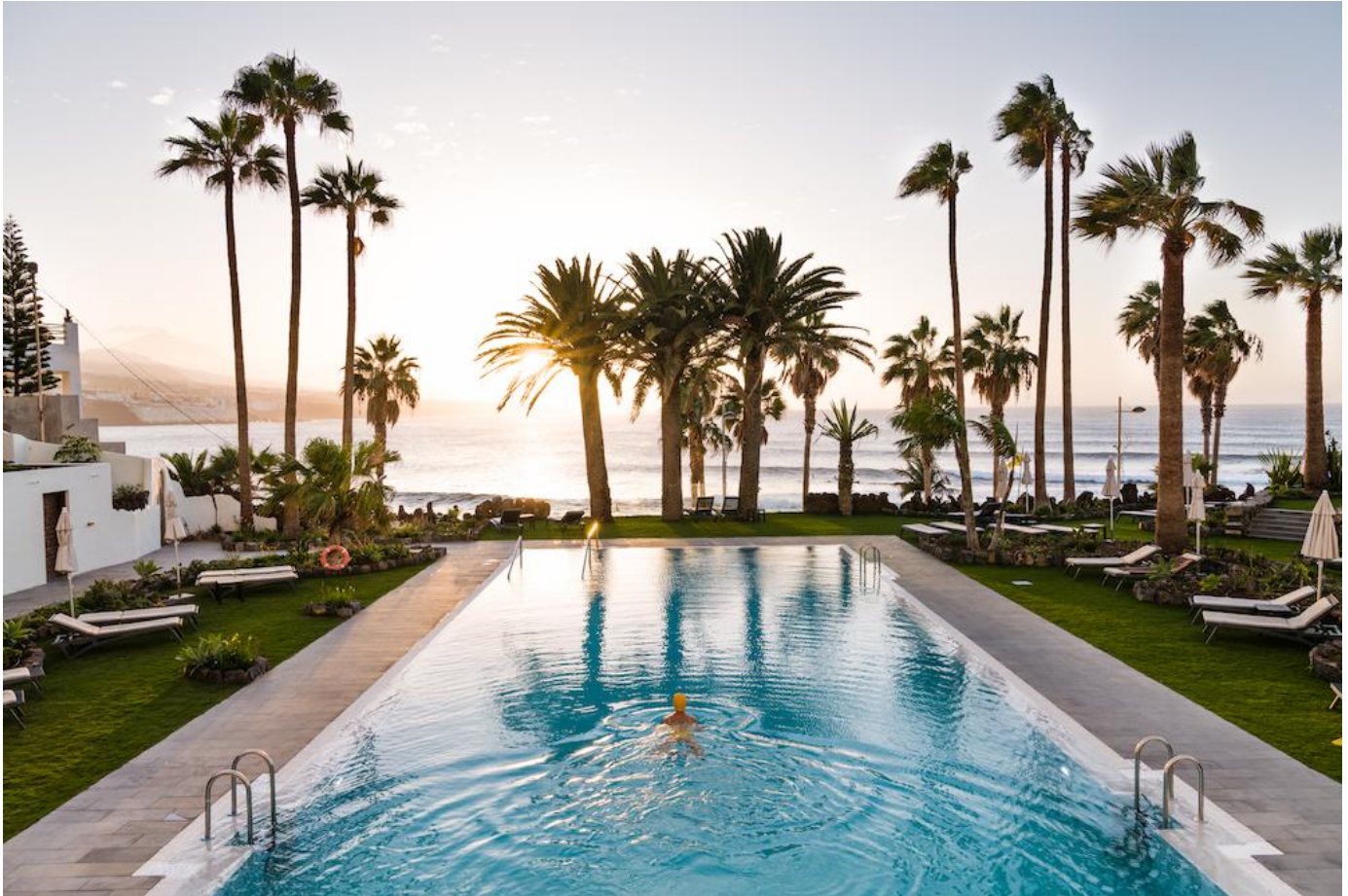
Sea water Infinity-Pool

The Canary Island of Tenerife offers beautiful sandy beaches, palm trees, mountains and volcanic rocks. The OCÉANO Health Spa Hotel ( https://www.greenpearls.com/de/hotels/oceano-hotel-health-spa-de/ ) is located in the northeast, directly on the Atlantic Ocean. There are several seawater pools and a large spa area with saunas. There is a daily yoga program and various fasting regimens. The cuisine is regional and healthy. And if you are a woman traveling alone, you will find that solo travel is completely normal and natural here. A shuttle service from the airport to the hotel is available.