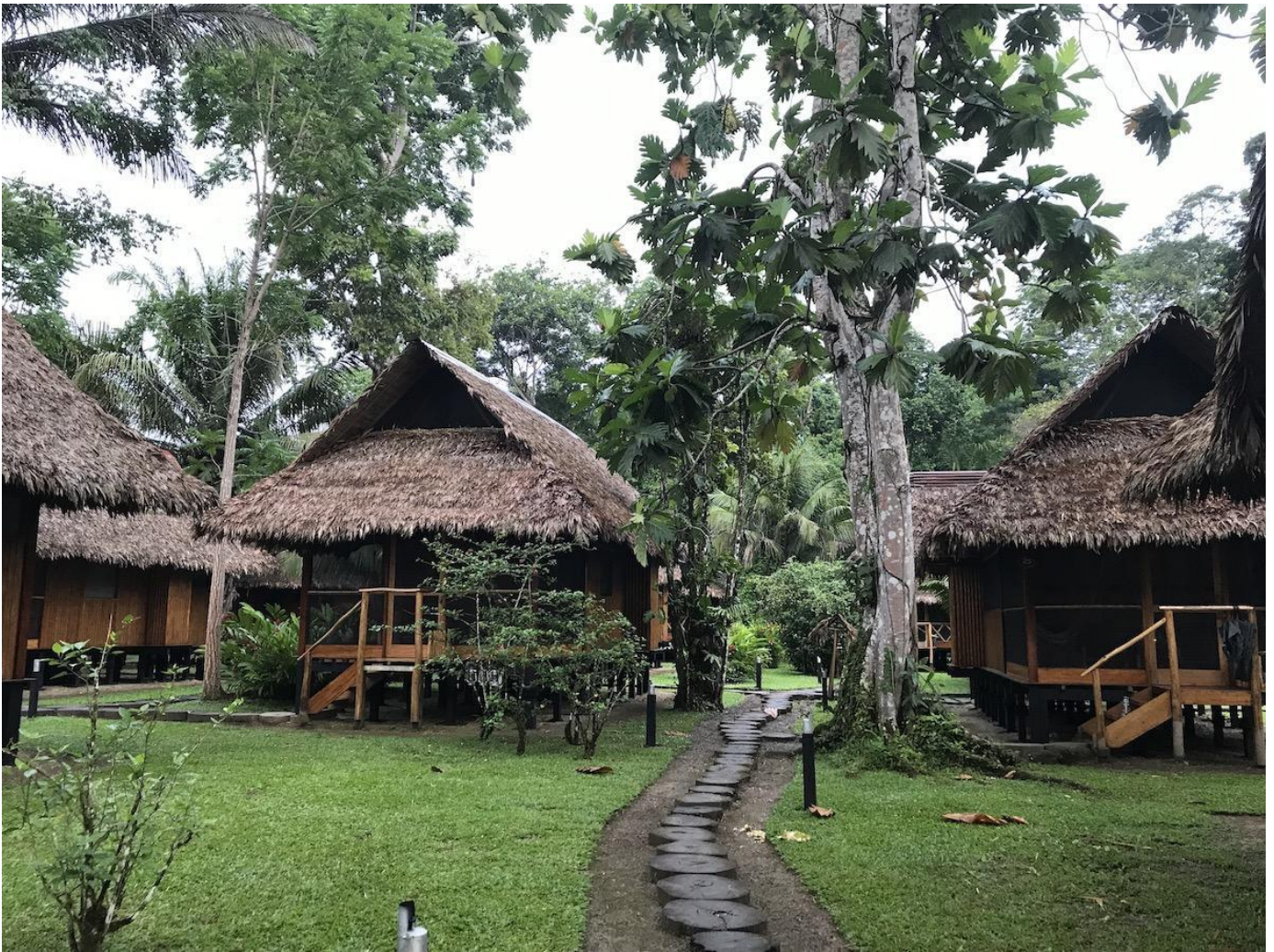
Sustainable Stay in the Rain Forest

We hope you enjoyed our review! Please let us know in the comments if it was helpful for you and if you were able to find the right vacation for you in the answers to the questions!