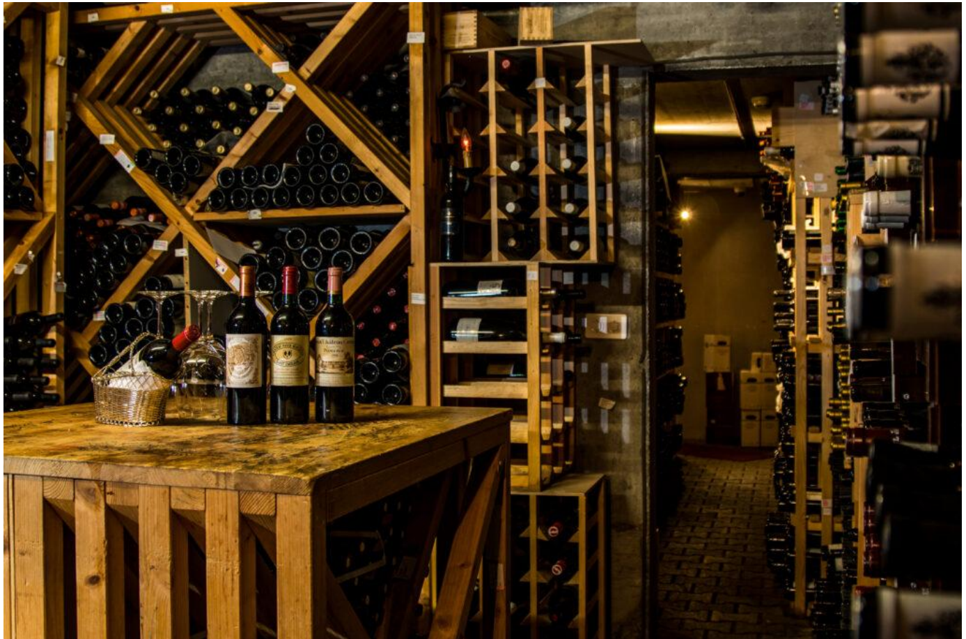
View into the wine cellar

The Waldhotel Fletschhorn ( https://www.greenpearls.com/hotels/waldhotel-fletschhorn/ ), is located outside of Saas Fee in the middle of Swiss nature. It is best known for its 18-point Gault Millaut restaurant. Here you can indulge yourself with seasonal gourmet menus made from the products of the region. There is a small spa with a sauna, steam bath, and massages, but no pool. Even if you arrive by car, with the guest card you can get around the property car-free. Numerous hiking trails, mountains, and glaciers await you.