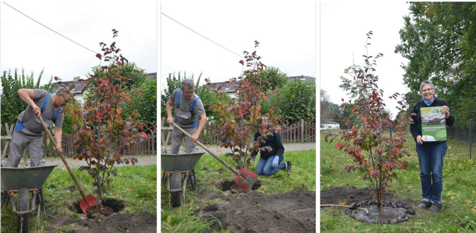
Planting a tree in the garden of the organic family and kids hotel Gut Nisdorf at the Baltic Sea

By the way, you can find out yourself whether you are the happy 5th guest: you will then receive a small symbol-key fob made of wood with a deer head on one and the tree of life on the other side. Besides, the hotel is also involved in a reforestation program in Panama as well as in a regional compensation of building up humus through a compensation CO2 program. Definitely some more reasons to visit the Berghotel Rehlegg !