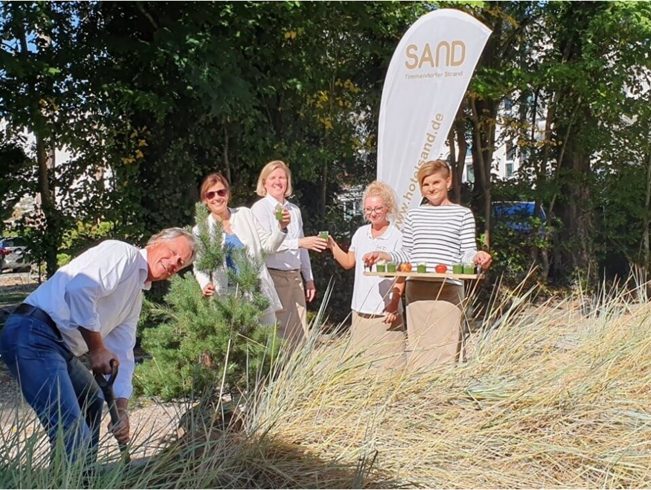
Planting a tree and enjoying some fresh green smoothies at Lifestylehotel SAND at the Timmendorfer Strand at the Baltic Sea

Also, the Lifestylehotel SAND has taken part together with some employees and even created a small event around: A pine was planted and to strengthen the participants (and the guests of course) green SANDsmoothies were served. The Gut Nisdorf at the Boddenseeküste at the Baltic Sea has also found space for a new tree on ist extensive garden property.