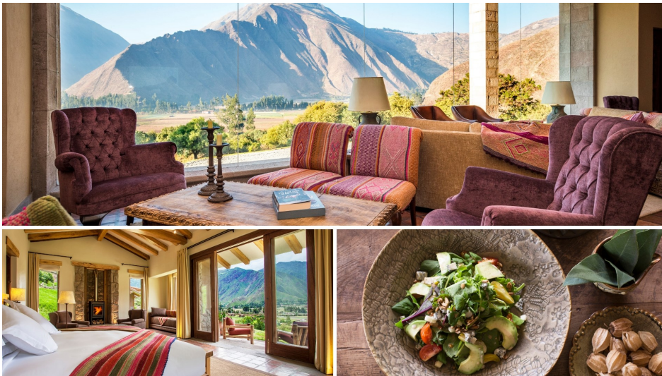
Enjoy the view over the Sacred Valley of the Incas and the delicious Peruvian food at Inkaterra Hacienda Urubamba 😊

You want to travel far this fall? Then make yourself comfortable at the Inkaterra Hacienda Urubamba ! The eco-hotel lies nestled among the red-shimmering mountains in the Urubamba Valley in the Cusco region. In the Sacred Valley of the Incas you can indulge yourself in the Mayu Spa – and even pick the herbs for your treatments yourself in the “Healing Garden “. The area around Hacienda Urubamba is a paradise for eco-friendly adventure sports, and also offers some of the most incredible Inca sites and beautiful scenery, picturesque villages, folk arts, and crafts, as well as the authenticity of Peru that traveler come searching for. After an exciting day, you snuggle up in front of your own fireplace and enjoy the view of the shimmering, red mountains.