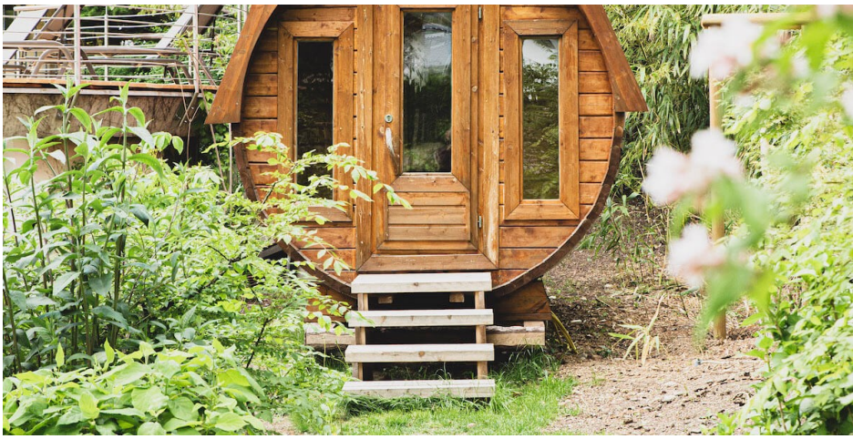
The perfect place for every weather: the forest sauna Biotique-Hotel LA VIMEA!