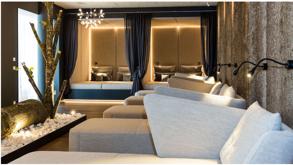
Relax in the huge spa and wellness area of © Refugim Lindenwirt