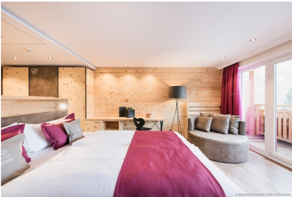
Enjoy the breathtaking scenery from the bedroom over the Alps of East Tyrol.

“A place in the middle of outside, where we can feel ourselves again, relax calmly, enjoy the regional ingredients that have been turned into delicious meals, and meet people that are good for us.” Naturhotel Outside