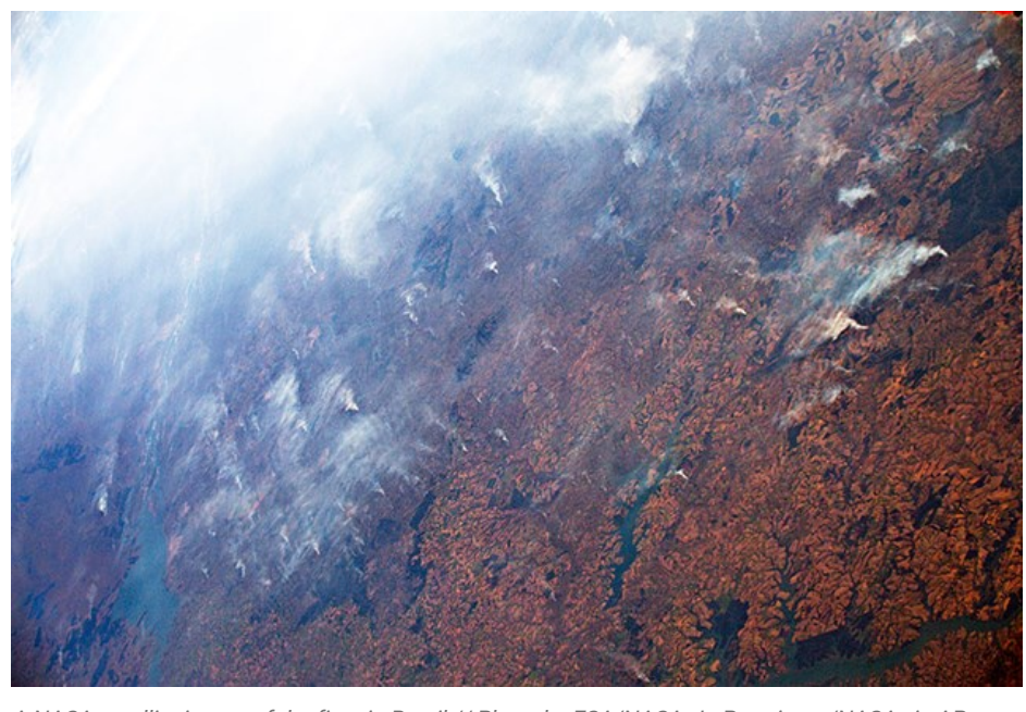
A NASA satellite image of the fires in Brazil

Brazil is set to reject aid to fight this year's record fires in the Amazon rainforest, multiple media outlets are reporting and sustainable ecotourism operator Inkaterra is calling for all concerned to do everything in their power to fight the fires.