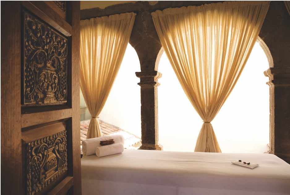
We're in love with the wood carvings on the doors at Inkaterra La Casona