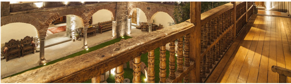
Breathtaking atmosphere in the patio of Inkaterra La Casona