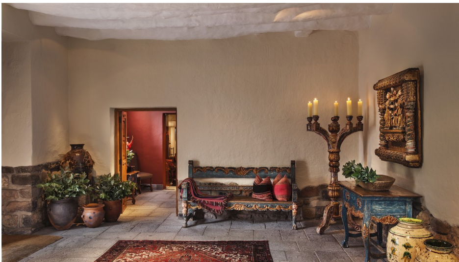
Lobby of Inkaterra La Casona with beautifully restored furniture

Today, the Boutique Hotel Inkaterra La Casona is a popular accommodation for travelers from all over the world and with its eleven luxurious suites often fully booked. It is also the first 5* boutique hotel of Cusco and the first Relais & Chateaux hotel of Peru. Not surprising as it is a combination of luxury, authenticity and sustainability. The suites offer underfloor heating, combine authentic pre-Columbian as well as colonial furniture from the family's own foundation, as well as cushions, textiles and tableware from different areas of Peru and each has a cozy fireplace. "Inkaterra La Casona looks back at a 400-year old history with different cultures and traditions. It is a gateway to the city's past, a living museum with the coziness of a Peruvian noble home.", Denise explains.