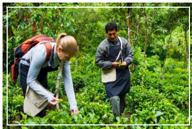
INKATERRA'S TEA ROUTE