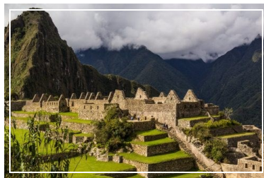
AN ADVENTURE GUIDE TO INKATERRA