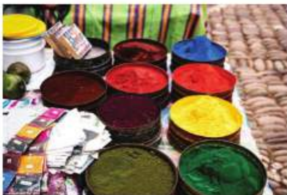
Clockwise from top left: A bright start to the day at Belmond Hotel Monasterio, Palacio del Inka's lobby, and natural paint pigments at Pisac's market.

STAY In an upscale suburban district of Lima, Belmond Miraflores Park offers peerless city and Pacific coastline views from its 89 suites and the rooftop's pool and Observatory