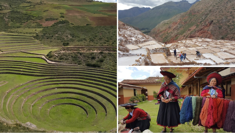
Ruins of Moray, salt mines of Maras and the textile center: we discovered all of this with our amazing guide from Inkaterra.

When deciding for an authentic souvenir you also contribute to the well-being of women, because they are provided a secure job and fair wages. By the way, every worker of the wool production is responsible for the whole process from production to sale. The fabrication of a poncho takes approx. three months, which is something you could consider when negotiating.