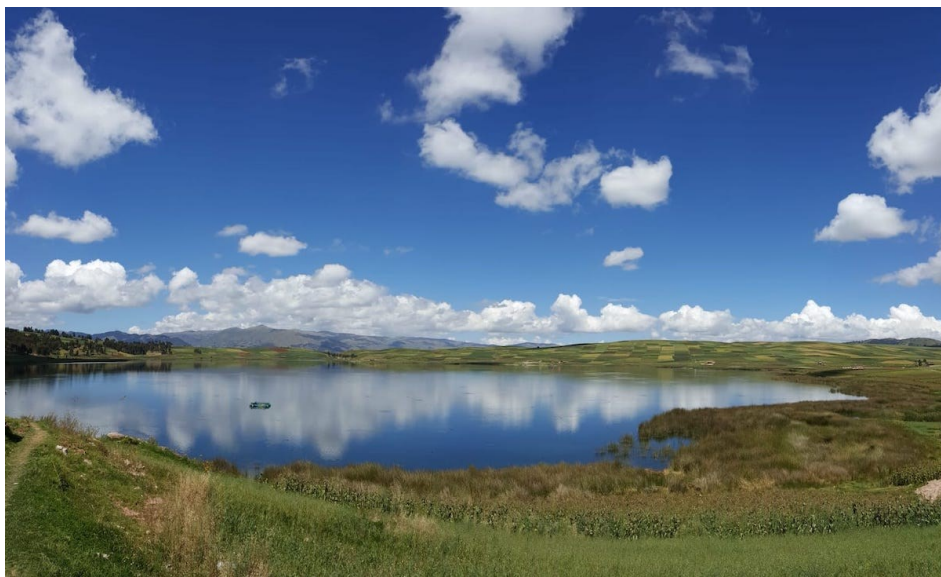
Half-day trip to Laguna Huaypo – the colors up here are just amazing!

Also, Cusco itself offers a lot, even if it can be very touristic at some corners. The quarter San Blas invites to just stroll along, gazing at the famous dodecagonal stone in a wall built by the Incas or visiting one of the tasty organic restaurants which also offer vegetarian and vegan food – which is not easy to find in Peru at all. We loved the food at the Organika but to get a seat you must be lucky.