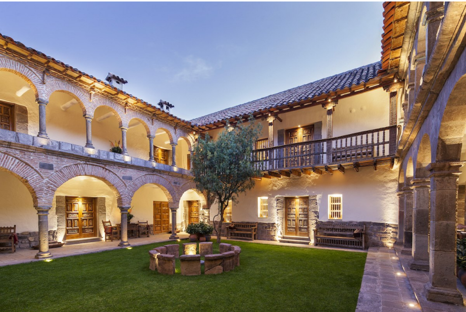
The patio of Inkaterra La Casona in the evening, the suites and rooms are accessible by the balcony.

From our last stop in the Sacred Valley of the Incas, we went to Cusco, where we stayed at the historical boutique hotel Inkaterra La Casona located at the Plaza Las Nazarenas. The building originates from the 16th century and was restored with lots of love for detail. Today it is home to eleven spacious and wonderful suites. Some of the furniture and design highlights are almost as old as the building and could only be conserved by gentle restoration. The wooden carvings in doors and balcony railings as well as some antique pieces of furniture are particularly impressive.