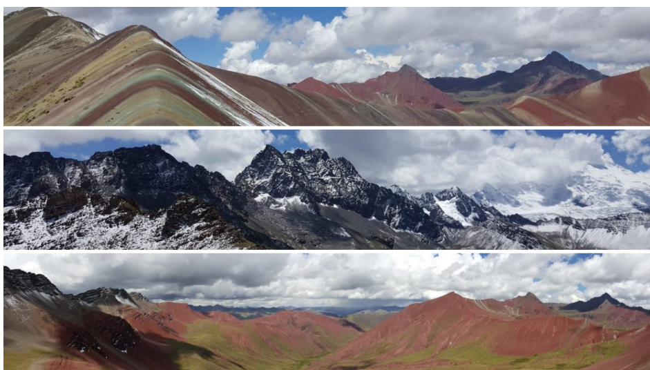
Rainbow mountain (top), view on the other side to impressive partly snow-covered peaks (middle) and the Red Valley (below).

Most tours to the Rainbow Mountain and the Red Valley start in Cusco as well. Unfortunately, the Rainbow Mountain is so overcrowded that a photo without tourists is almost impossible as well as just enjoying the natural wonder. But only a few travelers make the small swerve to the Red Valley, so the view of the red mountains is all yours. By the way, do not underestimate the height: though the distance is not far, the height puts a lot of pressure on the body. For me as well it was onerous and it took a while to reach the peak –to take one of the mules still was no option! Either I can do it myself or leave it 🙄