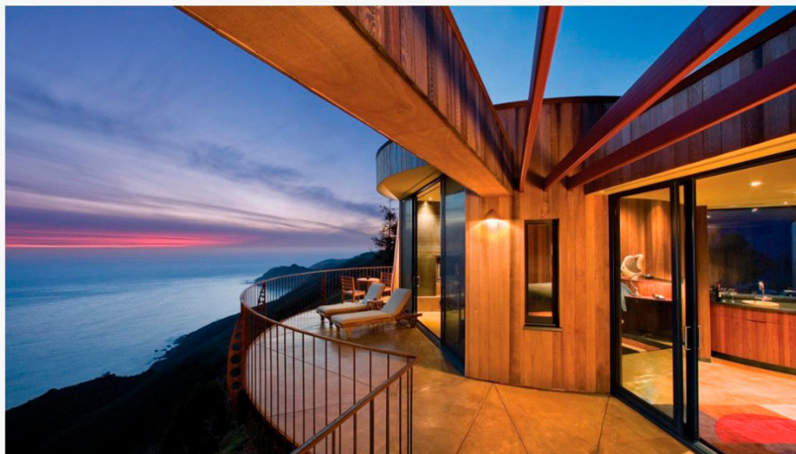
Post Ranch Inn, California

Post Ranch Inn is an outstanding boutique hotel high on the cliffs of Big Sur, the rugged stretch of Californian coast made famous by the likes of Jack Kerouac and Henry Miller. The award-winning Inn, a member of the Preferred Hotels & Resorts Legend Collection , has luxurious, grown-up Tree Houses with private stairways nine feet off the ground and spectacular views over the trees. Each one has modern interiors, a kingsize bed, window seats, a wood-burning fireplace, a walk-in shower, a skylight to watch the stars, a sundeck with mountain views, and, almost annoyingly, Wi-Fi. Every day, there's yoga and garden tours on offer, though you may just choose to wander the fragrant forests.