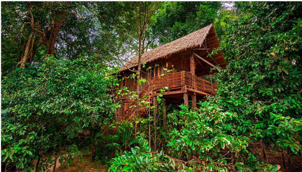
Wa Ale Island Resort Treetop Villas

Wa Ale Island Resort opened in October 2018 on the island of Wa Ale in southern Myanmar's Lampi Marine National Park , with a lovely location in a sheltered cove, overlooking a beach and intriguing rock formations. The island's only reachable via a high-speed transport boat from the mainland. As well as 11 tent beach villas, there are two treetop villas here, high up in the canopy, perfect for a romantic couple's getaway. The wooden structures contain kingsize beds and come with an outdoor shower and a private veranda for looking out to the beach and ocean. The island is home to monitor lizards, gibbons, rare pangolins, white-bellied sea eagles and more, while whale sharks, dolphins, manta rays and other impressive marine life populates the waters of the Myeik Archipelago.