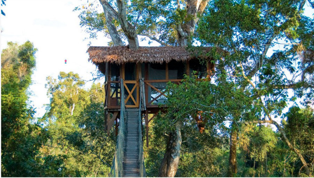
Canopy Treehouse at Inkaterra Reserva Amazonica

Reserva Amazonica is part of the Peruvian-owned Inkaterra hotel collection, with 35 luxurious wooden cabanas set in the Peruvian Amazon, adjacent to the Tambopata National Reserve on the bank of the Madre de Dios river. The Inkaterra Canopy Tree House is for those with a head for heights, a thatched constructed with a 26-metre-high vantage point from which to take in the sights and sounds of the Amazon. A night in the canopy tree house comes with a private butler to deliver snacks, cold drinks or chilled bottles of Champagne, plus a complimentary sun downer and a private dinner in the rainforest canopy.