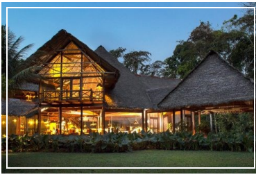
SPECIAL EVENINGS WITH INKATERRA