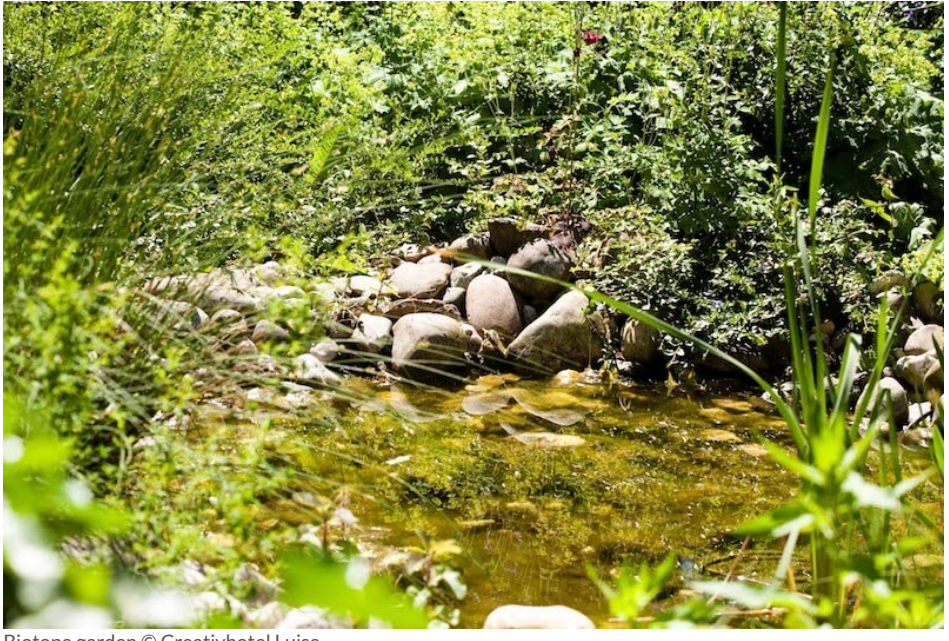
Biotope garden