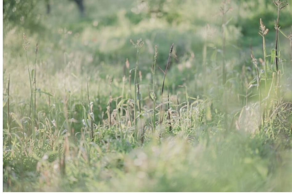
Meadow in the organic hotel garden

The opinions on all-year feeding of birds strongly vary. The idea was to protect the birds threatened by the insect death. It requires a sensitive handling, because the insectivores belong to the soft food eaters and are not interested in punches. Hence, you can buy either dead insects at a zoo shop, or provide soft feed like oatmeal, poppy, bran, raisins and fruit. If you are unsafe to you whether you should feed or not simply contact a conservation group in your region. "