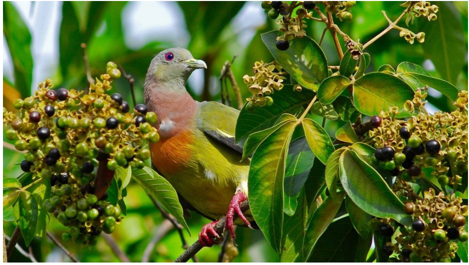
Pink-necked pigeon at © The Tongsai Bay

For the wellbeing of our ecosystems it is important to protect local wild animals. Just recently the <u>preservation of biodiversity in the garden</u> was one of our topics. Subject today is to give you practical tips for a close to nature garden design appropriate to the living space of the species living outside next to us. The initiatives of our <u>Green Pearls</u> partners demonstrate how easy it is to create a paradise for insects, birds, hedgehogs and other garden inhabitants!