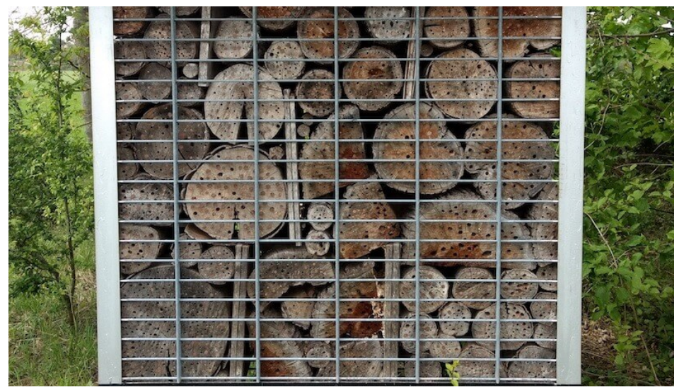
Insect hotel