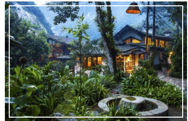
2017 ALL WRAPPED UP - INKATERRA'S HIGHLIGHTS