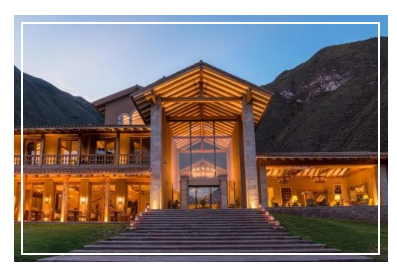
2018 ALL WRAPPED UP - INKATERRA'S HIGHLIGHTS