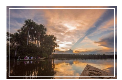
WHY PERU IS THE PERFECT PLACE FOR A DIGITAL DETOX