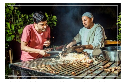
A MOMENT TO MARVEL: MOMENTO SELVA AT INKATERRA GUIDES FIELD STATION - MADRE DE DIOS / TAMBOPATA