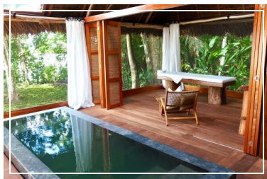
THE TREATMENTS TO TRY AT ENA SPA