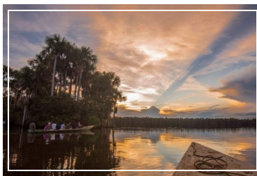
WHY PERU IS THE PERFECT PLACE FOR A DIGITAL DETOX