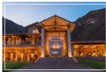
2018 ALL WRAPPED UP - INKATERRA'S HIGHLIGHTS