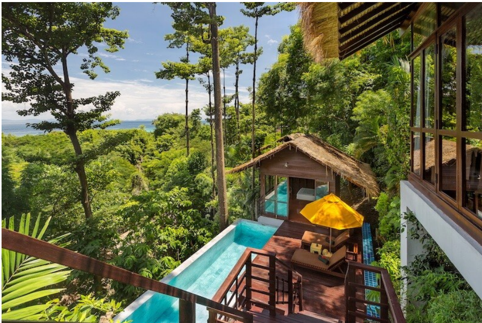
Bathing amidst the nourished garden of Zeavola Resort.

The Maldivian Reethi Beach Resort has implemented a recycling economy. More than half of all leftovers are processed in their own biogas plant, which in turn supplies the hotel kitchen with biogas for cooking. The by-products of the biogas production, such as sludge and water, are reused as fertilizer for the hotel's own organic garden. If you don't have your own garden and therefore your own compost pile, check out small composting boxes, so-called wormeries. Some of them can also stay indoors or are a nice piece on your balcony!