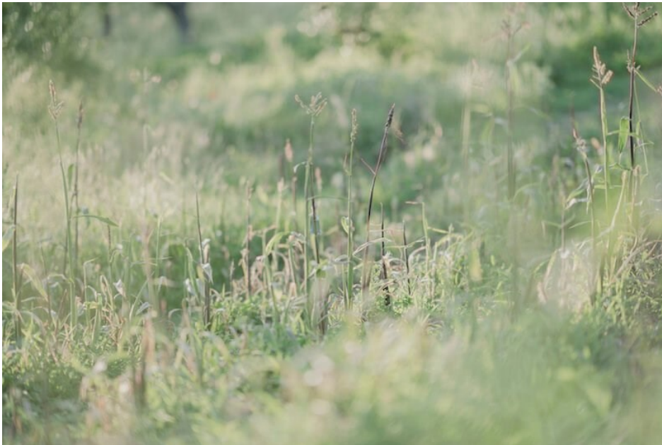
Untidy garden and long grass at i pini to protect animals.