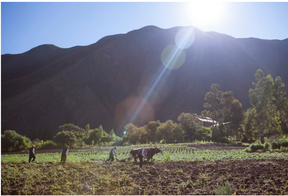
The hotel's own organic farm at Inkaterra Hacienda Urubamba.