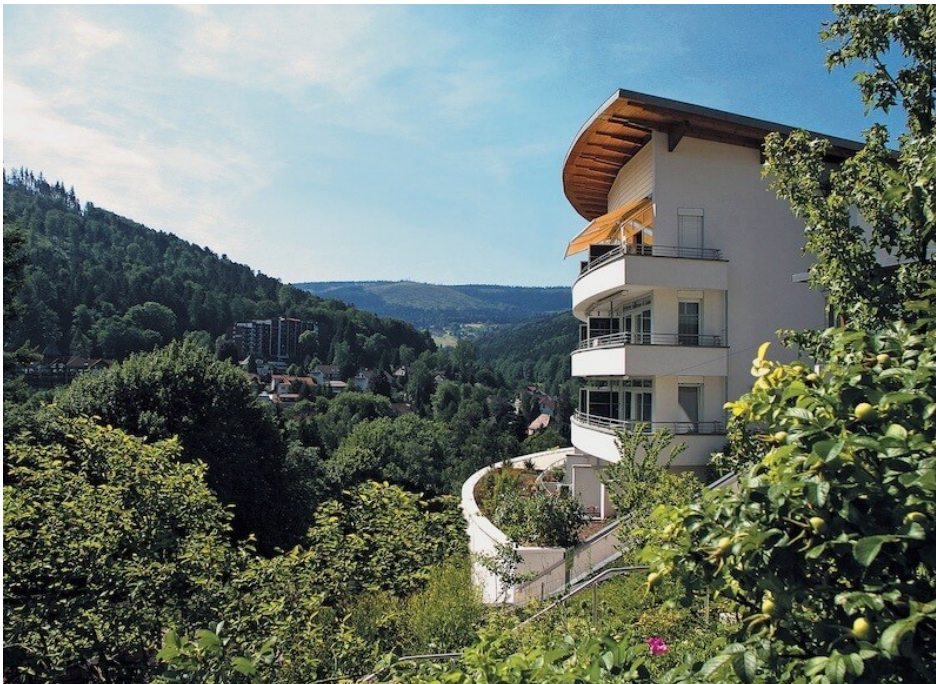
View of the selfness-hotel SCHWARZWALD PANORAMA and Bad Herrenalb.