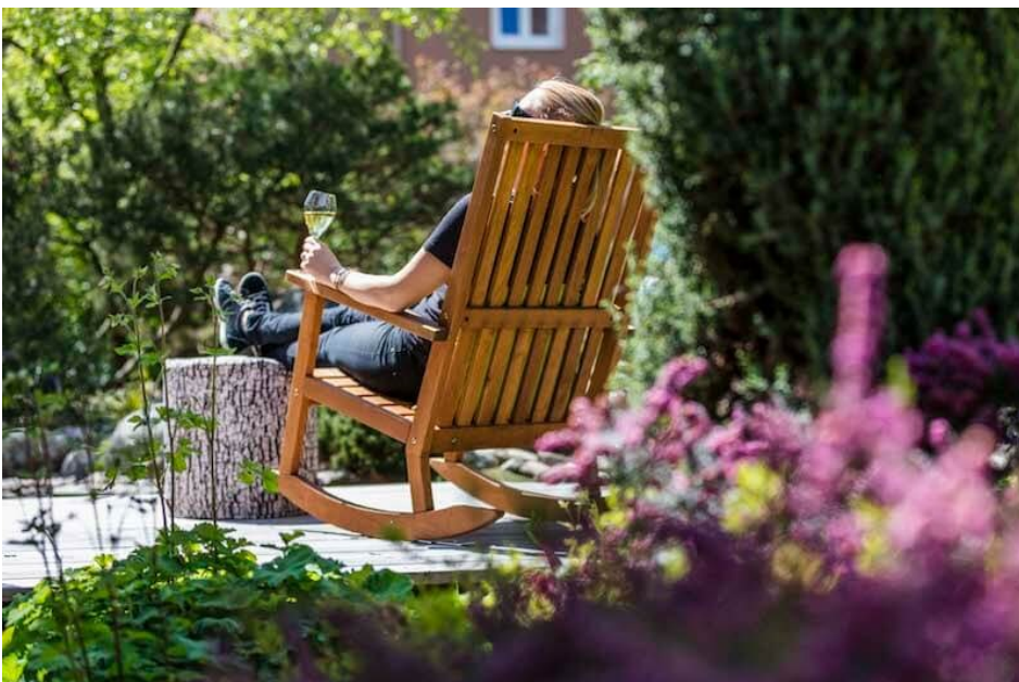
Relax in the biotope garden Biotope garden