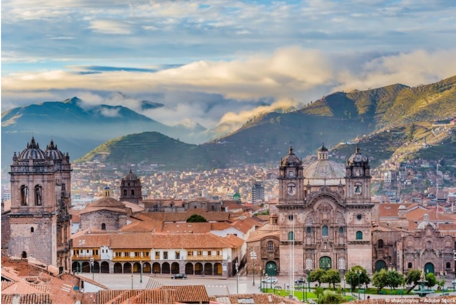
View of Cusco

You find Manna - die Spezerei in Salzstrasse 28 in Freiburg