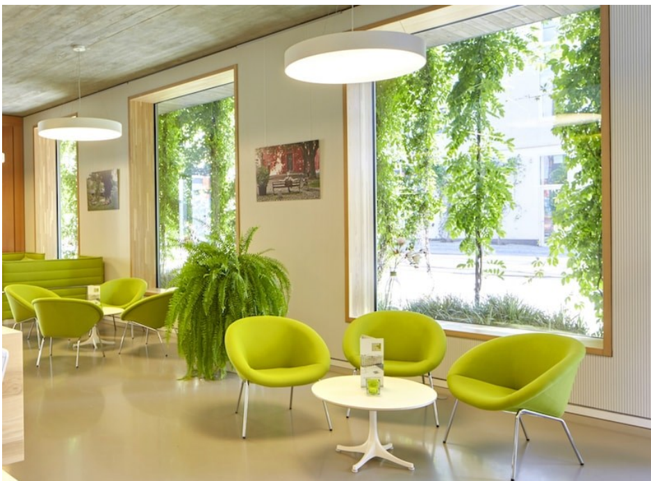
Lobby of the sustainable Green City Hotel Vauban in Freiburg

The Eiffel Tower, Big Ben or the Empire State Building – planning city trips we usually end up with touristic hot spots, at least they are the landmarks of these towns. As you know, we support touristic offers off the beaten tracks, so that you will get to know the true charm of this place. But how exactly can you find these untouched and unique spots as a visitor? Who would know better, than local residents? Therefore, we have asked our green city hotels for you for their personal insider tip.