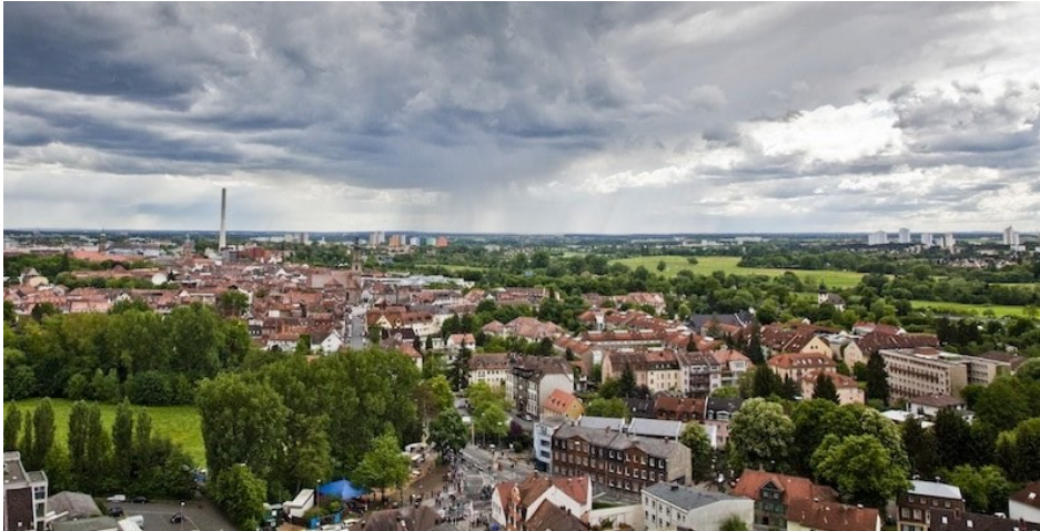
View of Erlangen