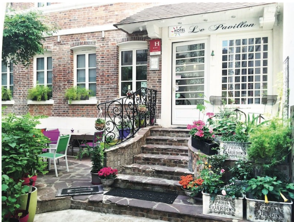
Green yard amidst Paris

Nevertheless, for more green tips for the Fairtrade city of Erlangen have a look here: www.fairlangen.org