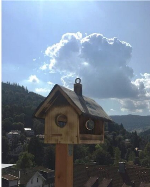
Bee hives and bird house