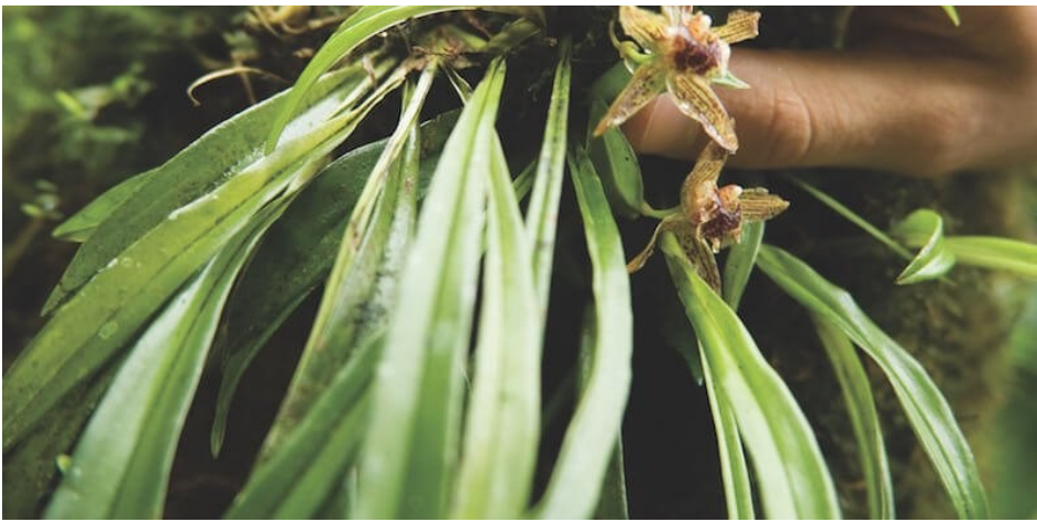
Native orchid in Peru