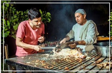
A MOMENT TO MARVEL: MOMENTO SELVA AT INKATERRA GUIDES FIELD STATION - MADRE DE DIOS / TAMBOPATA