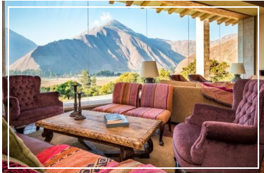
VOTE FOR INKATERRA IN THE TRAVEL + LEISURE AWARDS