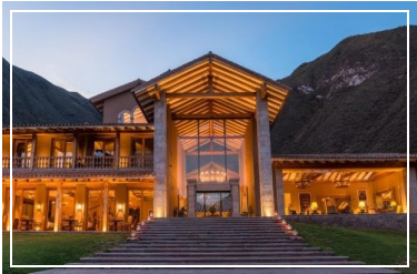
2018 ALL WRAPPED UP - INKATERRA'S HIGHLIGHTS