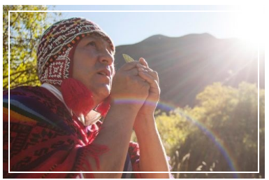
THE ANCIENT RITUAL OF COCA LEAF READING IN THE ANDES