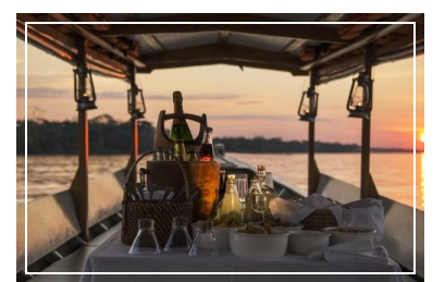
A PERUVIAN VALENTINE