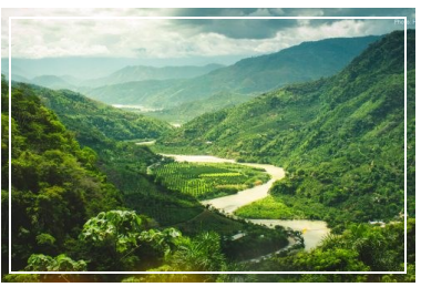
SIX SITES TO DISCOVER IN PERU