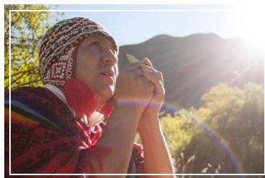
THE ANCIENT RITUAL OF COCA LEAF READING IN THE ANDES