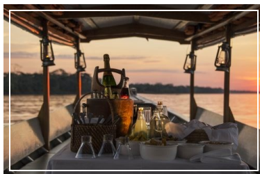
A PERUVIAN VALENTINE