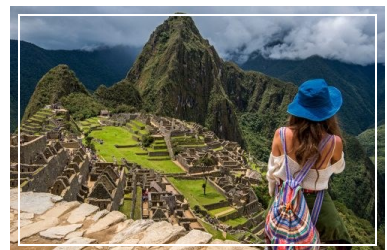
THE PERU BUCKET LIST: WHY TO VISIT PERU IN 2019