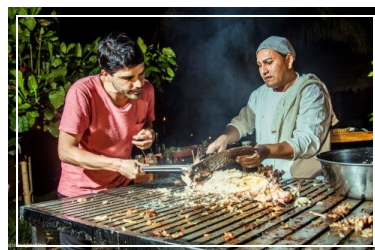
A MOMENT TO MARVEL: MOMENTO SELVA AT INKATERRA GUIDES FIELD STATION - MADRE DE DIOS / TAMBOPATA