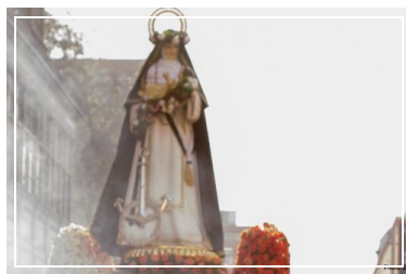
SANTA ROSA DE LIMA