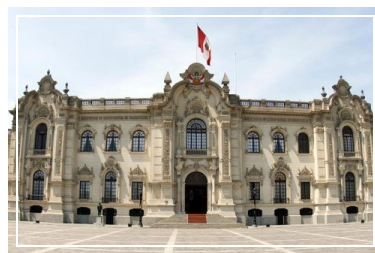
CELEBRATING FIESTAS PATRIAS IN PERU