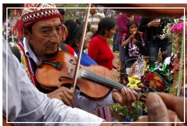
DIA DE LOS DIFUNTOS