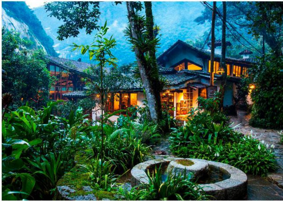
Inkaterra Machu Picchu Pueblo Hotel is set in lush tropical gardens.

As a member of Virtuoso & the National Geographic Unique Lodges of the World, the property showcases 12 acres of exuberant tropical gardens located within the ‘cloud forest’ of Machu Picchu.