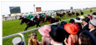
Five of the best British racecourses to visit in 2019