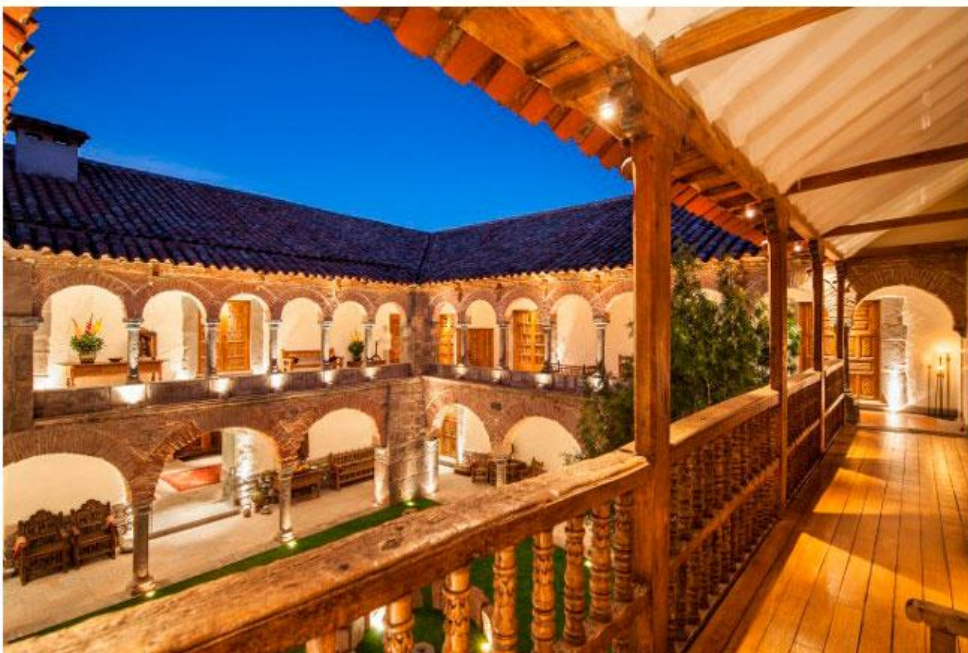
Inkaterra La Casona is a beautifully renovated 16th century manor house.

Located in the traditional Plaza de las Nazarenas, Inkaterra La Casona is an artistic and historic hideaway. The refurbished 16th century manor house is the first boutique hotel in Cusco and first Relais & Châteaux property in Peru.