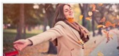
The winter coats worth investing in this season