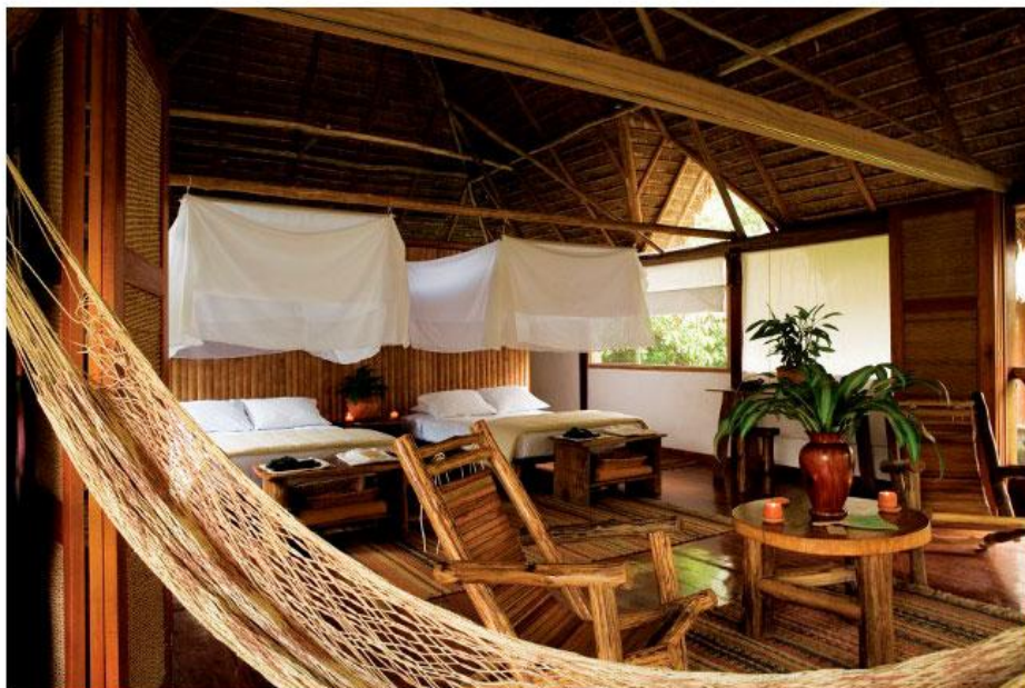
Inkaterra Reserva Amazonica is an eco-luxury lodge deep in the rainforest.

Known as Peru’s capital for biodiversity, Puerto Maldonado is a stone’s-throw from Tambopata National Reserve in Madre de Dios and is host to some of the most complex eco systems on earth.