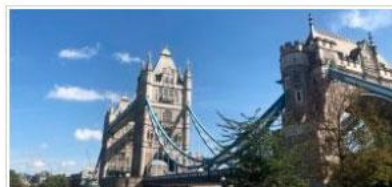
Review: One Tower Bridge, Tower Bridge in London