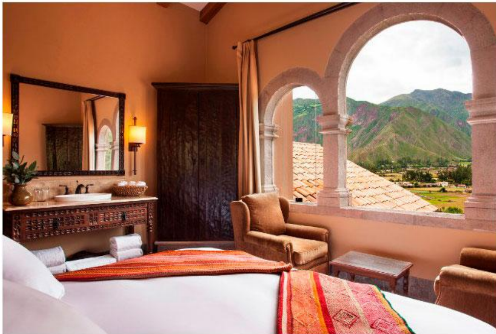
Inkaterra Hacienda Urubamba offers stunning views to wake up to.

Nestled between the city of Cusco and the famed Machu Picchu lies Inkaterra Hacienda Urubamba, a plantation-style hotel set amid imposing green mountains and harvest fields which showcases two styles of accommodation, 12 luxury rooms and suites in the Casa Hacienda and 24 independent casitas.