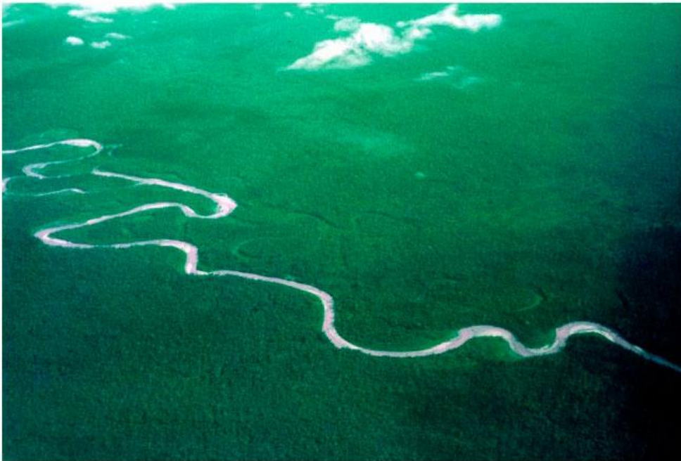
The Madre de Dios River is just one of Peru's many natural wonders.

Set amid the immense Amazon, which envelopes up to 62% of Peruvian territory, the country is also host to thousands of wildlife species including over 1,835 classes of birds (131 endemic), 84 out of the 104 Holdridge life zone systems and Lake Titicaca, the highest navigable lake on the globe (3,812m / 12,507ft.a.s.l).