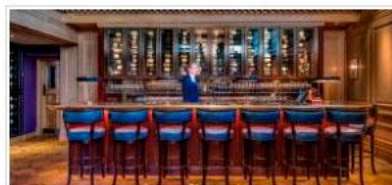
Raise a glass in the capital: London's finest wine bars and shops