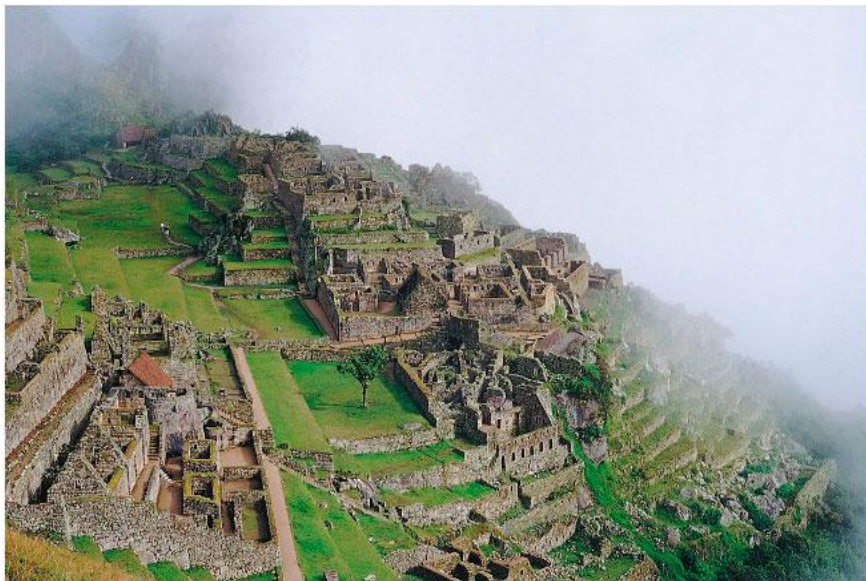
Machu Picchu is a must-see sight when visiting Peru.

Take a privately guided tour of one of Peru's most celebrated ancient ruins, Machu Picchu, and explore the history of the host of events that occurred on site.