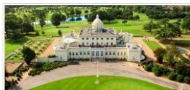
Six of the UK's most lavish hotels