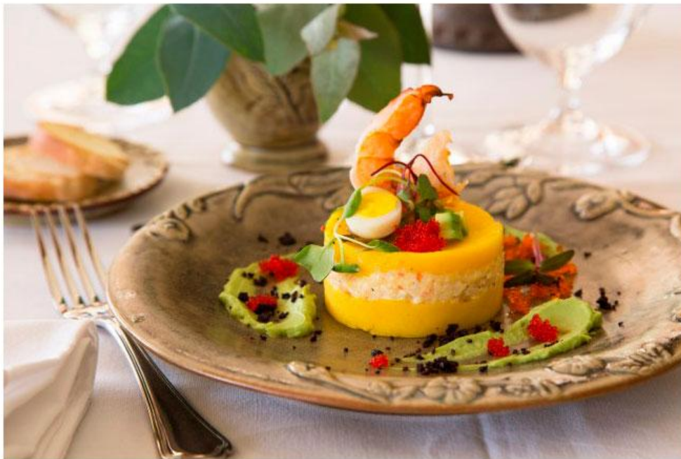
Inkaterra Hacienda Urubamba showcases the "earth to table" concept.

Carried out with a 10-acre organic plantation, guests are invited to pick their own produce, which is then created in to a luxurious meal by the Inkaterra chefs.