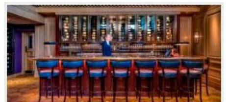
Raise a glass in the capital: London's finest wine bars and shops