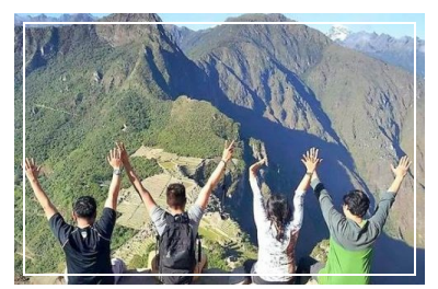
THE HISTORY OF THE INCAS