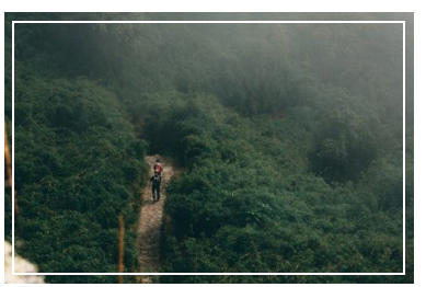
HIKING IN PERU; A MYRIAD OF ADVENTURES