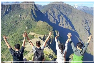
THE HISTORY OF THE INCAS