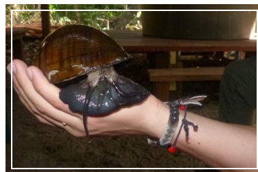
THE CHUROS PROJECT - SNAILS IN THE AMAZON RAINFOREST