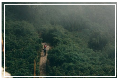
HIKING IN PERU; A MYRIAD OF ADVENTURES