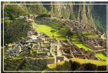
A BRIEF HISTORY OF THE INKA EMPIRE