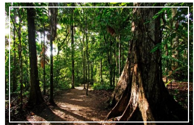
FIVE THINGS YOU DIDN'T KNOW ABOUT THE AMAZON