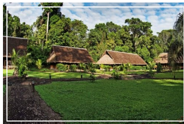
RENOWNED FILMMAKER AND SCREENWRITER, WERNER HERZOG, RETURNS TO PERU TO SHARE HIS FILMMAKING EXPERTISE