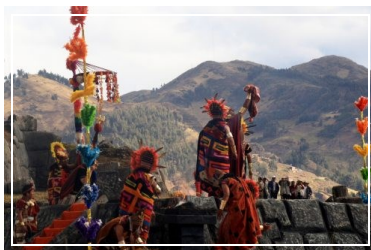
THE ANCIENT RITUALS OF INTI RAYMI