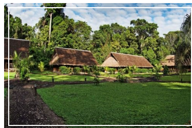
RENOWNED FILMMAKER AND SCREENWRITER, WERNER HERZOG, RETURNS TO PERU TO SHARE HIS FILMMAKING EXPERTISE