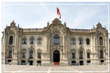
CELEBRATING FIESTAS PATRIAS IN PERU