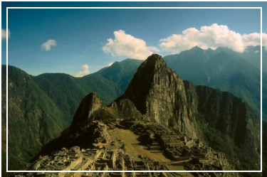
LLAMAS AND PERU