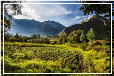
INKATERRA: GUESTS' PERSPECTIVES