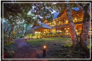
INKATERRA: GUESTS' PERSPECTIVES