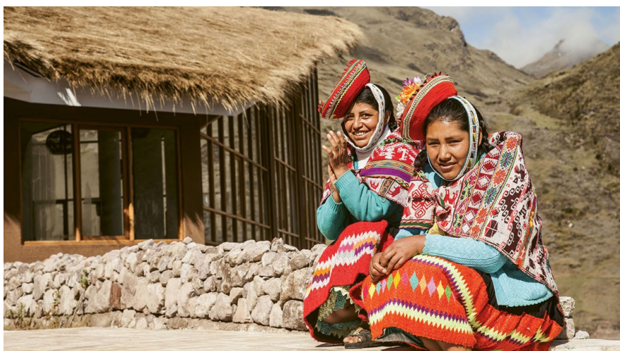
Staff members at the Huacahuasi Lodge, an eight-room property in the Lares District.

Soaking in the large Jacuzzi within the garden courtyard of the lodge is beyond relaxing, as you're surrounded by looming mountains and green scenery, not to mention the lodge has adorable resident llamas. Guests have their own terrace or patio overlooking this view. Lamay Lodge serves as the starting point for a trek to the ruins of Huchuy Qosqo.