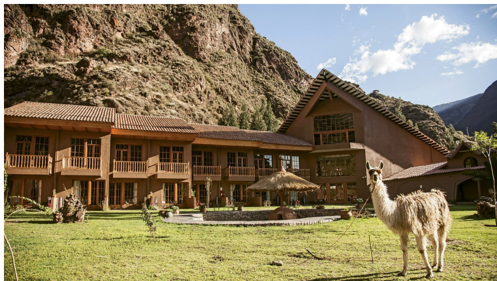
A resident llama at the Lamay Lodge, which serves as the starting point for a trek to the ruins of Huchuy Qosqo.