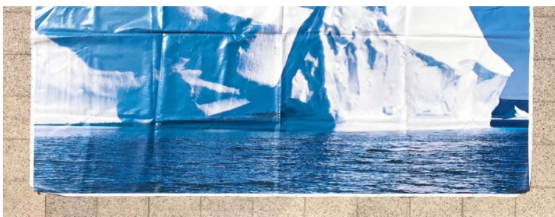
Ben Förtsch and the saved advertising tarp

Contributing to climate protection with a stylish bag collection? That does not only rhyme, but is indeed possible, as Creativhotel Luise has demonstrated. Inspired by the picture of an iceberg on an old advertising tarp, Germany's first climate-positive hotel launched a special campaign: in cooperation with sine design , it produced up cycling bags from pieces of the advertising tarp and scraps of artificial leather taken from the upholstery industry. The proceeds from the sale will be granted to the Earth Day Canopy Project, supporting their goal of planting 7,8 billion new trees in order to stave off the effects of climate change. The sale has been running since the end of last year and the first part of the proceeds was donated on Earth Day. If you want to participate, too, you can buy one of the stylish bags in Erlangen – or make a direct donation to the Canopy Project.