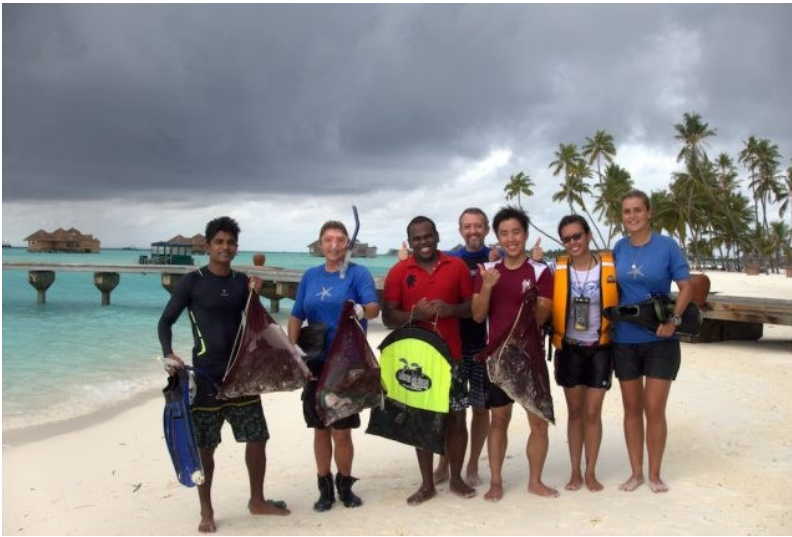
The Gili team takes care of plastic waste in the ocean

The goal of this year's Earth Day – end plastic pollution – is particularly important to Gili Lankanfushi on the Maldives. By means of a strict “no plastic policy”, employee training, beach cleanings and cooperations with various environmental initiatives, the resort has been fighting for the prevention and recycling of plastic waste for years, organizing events like “ Paddle against Plastic ” on Global Recycling Day. Yet the problem is more present than ever in the island nation in the Indian Ocean. To further raise awareness, the Gili Lankanfushi team distributed cloth bags on Earth Day – one more little step towards plastic prevention.