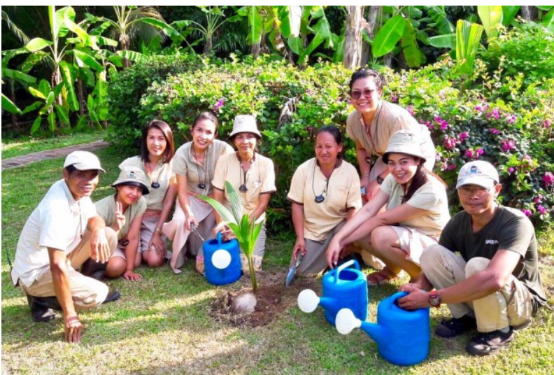
The Tongsai Bay team with a newly planted coconut sapling

Actually, one could think that there are enough trees on the