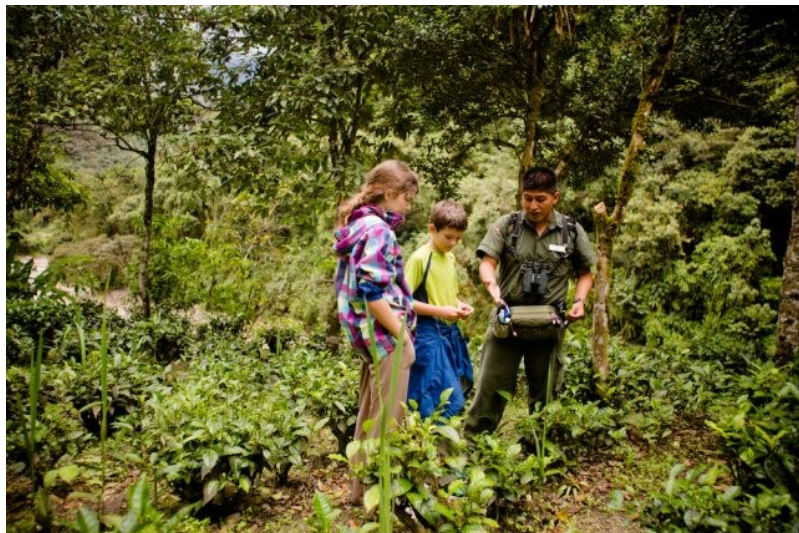
Guided nature tour by Inkaterra Machu Picchu Pueblo Hotel

Guests at Inkaterra Machu Picchu Pueblo Hotel in Peru also had the opportunity to plant trees, thereby participating in the reforestation of the cloud forest area. Due to numerous guided tours, you can explore Peru's breathtaking nature all year round when you stay at an Inkaterra hotel. On Earth Day, some of them additionally organized hiking tours for staff and guests to clean the surrounding area from waste – perfect for exploring the fascinating nature and at the same time contributing to its preservation. This combination characterizes every vacation at the Inkaterra hotels, as their tourist activities also finance Inkaterra Asociación – a non-profit organisation that is committed to the research and preservation of the local flora and fauna.