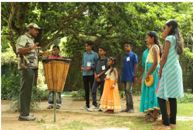
At Spice Village, children learned a lot about waste separation

The hotel group CGH Earth begins its environmental education projects at an early stage. On Earth Day, Spice Village invited schoolchildren and gave them a tour of the resort's premises and its sustainable and eco-friendly measures. The children learned a lot about solar energy, responsible water management and above all about recycling and avoiding waste: Spice Village produces only a very small amount of plastic waste, for instance by using glass bottles, ceramic containers and paper straws. Some of the furniture is made of recycled pinewood from former packing cases and handmade paper is produced from old newspapers and magazines. With so many creative ideas, we are