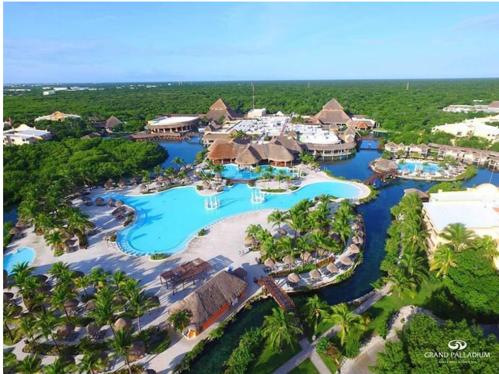
Another astounding resort development with conservation at its core is Grand Palladium Resorts & Spa, with over 200 hectares of mangrove and lowland forest, only 13% of the property is built up.

All international sustainable tourism experts and speakers will fly themselves in. They will support the advocacy of cleaning up Boracay and invite LGUs, tourist businesses, and everyone else who make a living from tourism. Let's all be on the same page, as they say.