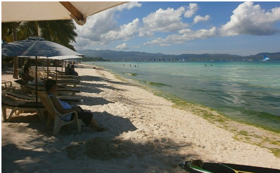
Boracay