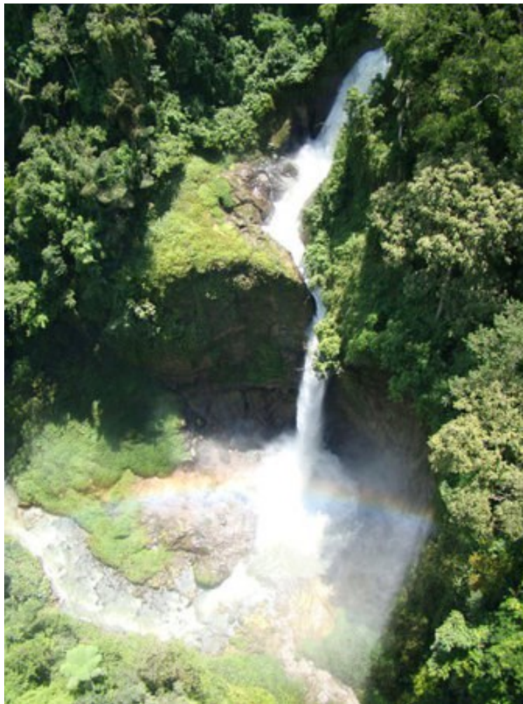
Lake Sebu

If we cannot have this mindset, I guess we just have to take another route like what the President said: Close it. And that's the saddest thing that could happen.