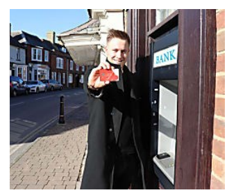
Brilliant Way To Check If You Had PPI ALLAY