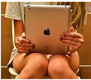
Leftover IPad Stocks worth over £619 selling for under £58 Swoggi