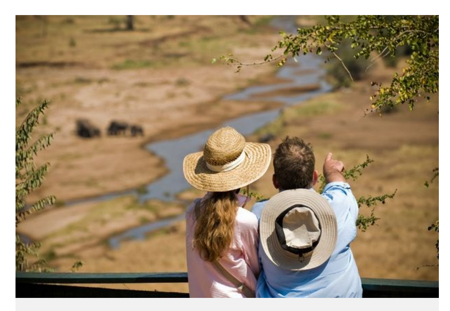
On safari in Tanzania

We've all seen elephants, giraffes and lions in the zoo, but being able to drive up close (but not too close, mind you) to them on the Serengeti is infinitely more magical than a trip to Phoenix Park or Fota.