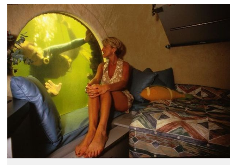
The sealife can be pretty wild out there

Jules' Undersea Lodge in Florida's Key Largo is probably one of the unlikeliest hotels on the planet, sitting 30 feet underwater in crystal clear tropical waters.