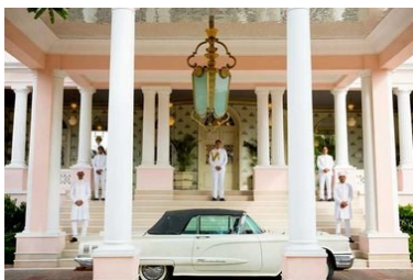
How I Got the World's Best Hotels All to Myself — And How You Too Could Score Uber-VIP Travel