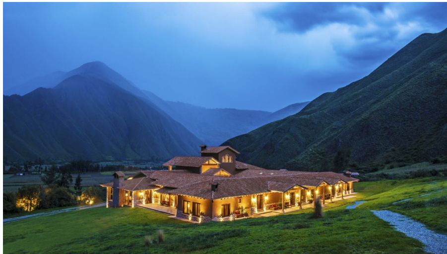
Inkaterra Hacienda Urubamba

can connect their body and mind. The spa will be a way to truly connect with Peruvian nature and history.