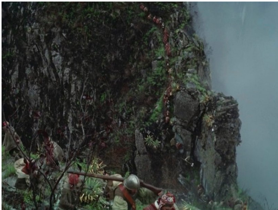
One of the first images of Aguirre: The Wrath of God - the expedition group are led down the Huayna Picchu by Klaus Kinski

For 11 days, between 1st and 11th May, each film-enthusiast will create a short film under the watchful, expert eye of Werner Herzog, submerged in the dense Amazon rainforest. Film-buffs will be guided through content conception, script writing, sound and even editing, using the local inhabitants as characters.