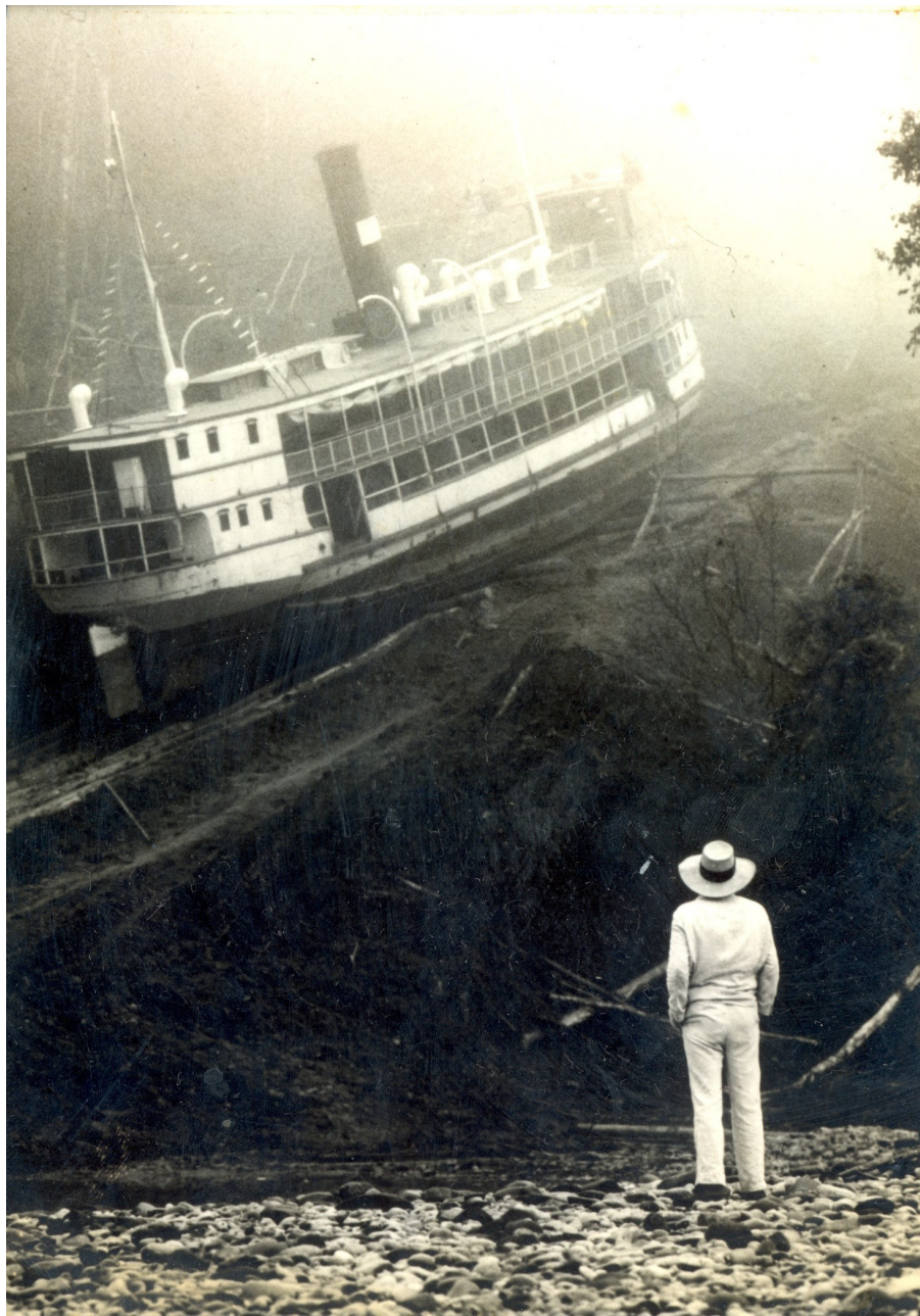
This photograph shows the boat that was part of Fitzcarraldo: - Klaus Kinski watches the SS Molly Aida crossing the mountain from one river to the other

'Filming in Peru with Werner Herzog' is set to be held in the vast Tambopata Reserve, on the banks of the Madre de Dios River. Their base, food and editing station - Inkaterra Guides Field Station . Day-by-day, the Field Station offers eco-conscious travellers the opportunity to explore the rainforest and actively partake in crucial, ongoing conservation projects, such as camera-trapping and tracking the migration of native bird species.