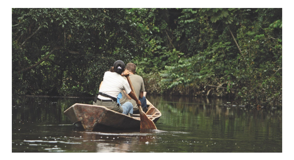
Inkaterra Guides Field Station In June, we welcomed Inkaterra Guides Field Station into our portfolio of eco-lodges, offering eco-conscious travellers the opportunity to

ere at Inkaterra, we're both grateful and delighted to say that 2017 has been another action-packed year. As we move into the New Year, we thought we'd share some of our 2017 highlights; from the launch of Inkaterra Guides Field Station in the Amazon rainforest of Southern Peru and being included within three of Condé Nast Traveler Readers' Choice Awards, to spotting four playful Pygmy Marmosets in an Ubos Tree.