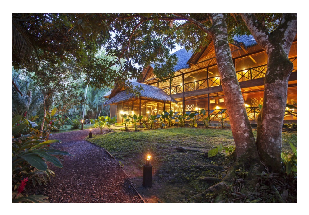
Andean Spectacled Bear Peruvian Coin

In October, we were thrilled to be included in the Conde Nast Traveler Readers' Choice Awards 2017, and that all five of our luxury boutique properties were included in three of Condé Nast Traveler's highly distinguished categories: Best Hotels in the World, Top Hotels in South America, and Top Resorts in South America.