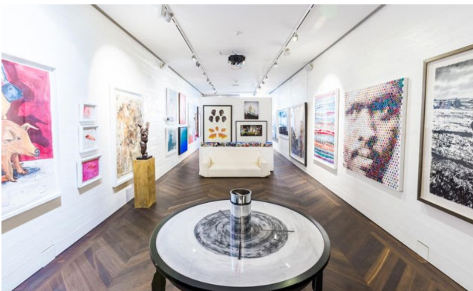
PRIVATE ART COLLECTION OF THE EXCLUSIVE ELLERMAN HOUSE IN CAPE TOWN. GUESTS CAN EXPECT TO SEE THE BEST ART THE COUNTRY HAS TO OFFER IN THE NATIONAL GEOGRAPHIC EXPERIENCE IN SOUTH AFRICA, PART OF THE EXPERIENCE ART & CULTURE: AN ONLINE AUCTION, ENDING 8 DECEMBER.

South Africa, with its complex history and diverse cultures, is a haven for art lovers. The winner of the auction will experience a wide breadth of art, from contemporary African art to ancient Shangaan tribal art to photography of the country's world-famous wildlife. This specially crafted itinerary features an exclusive afterhours tour of the edgy new Zeitz Museum of Contemporary African Art in Cape Town led by the executive director or chief curator. It opened only a few months ago and is housed in a converted grain silo on the famed Victoria and Alfred Waterfront. The vision of the museum is to become a platform for Africans to tell their own story.