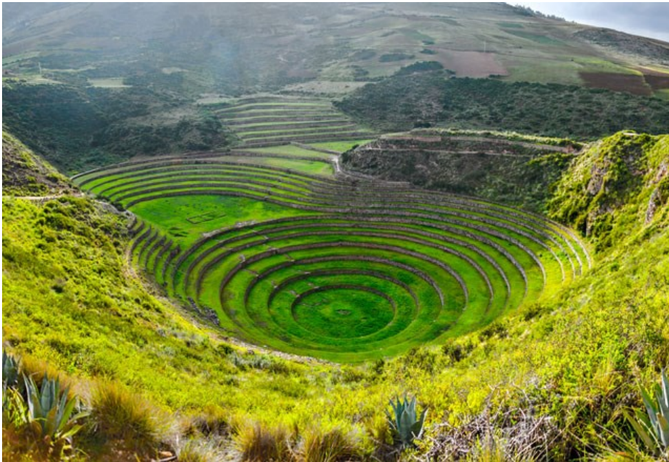
INCAN AGRICULTURAL TERRACES IN THE PERUVIAN SACRED VALLEY, PART OF THE NATIONAL GEOGRAPHIC EXPEDITION TO PERU, FROM THE EXPERIENCE ART & CULTURE: AN ONLINE AUCTION, ENDING 8 DECEMBER.

a hands-on brewing lesson of chicha de jora (traditional corn beer) while learning about the history of the drink and its role in the local culture.