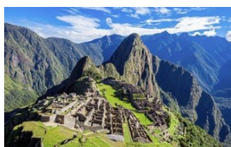
Machu Picchu – Inkaterra

Andean bear | Inkaterra | Machu Picchu | Paddington 2 | Peru | Spectacled bear