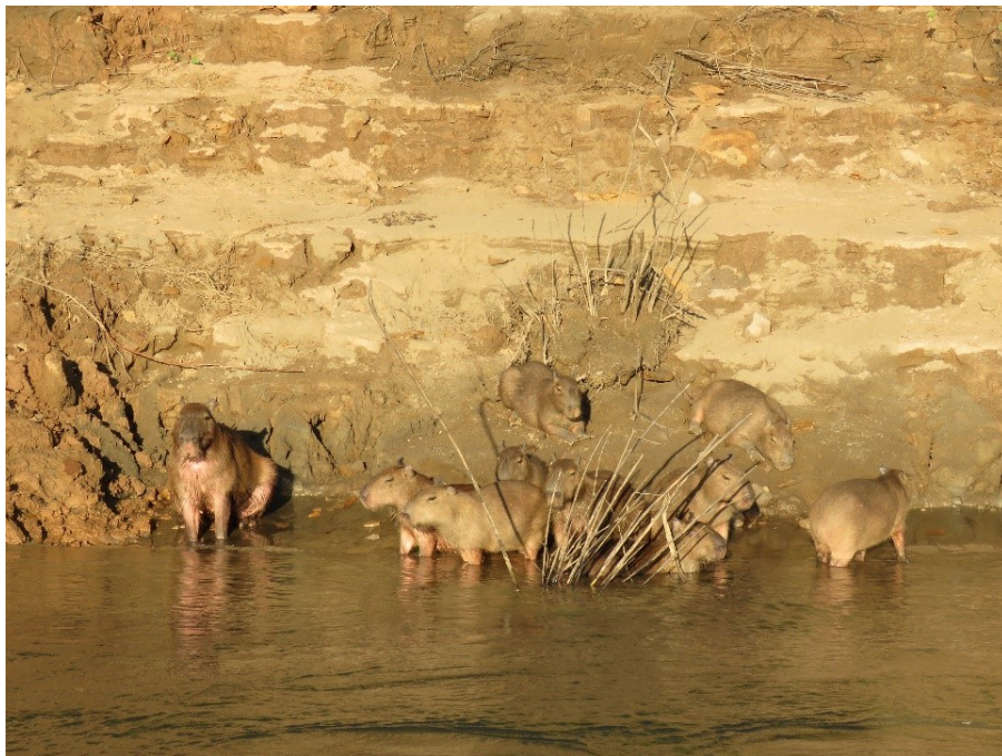
CAPYBARA RONSOCO Plinio A. - Inkaterra Explorer Guide

A group of guests were on their way back from the Inkaterra Canopy Walkway with an Explorer Guide in late September when they spotted a herd of Capybara Ronsoco resting on the river bank, basking in the late afternoon sun. The largest and heaviest rodent of the caved family, the Capybara Ronsoco is a highly social animal living in groups of around 10-20 individuals.