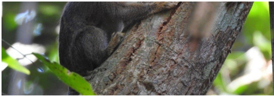
PYGMY MARMOSET